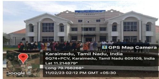
Group of students with staffs