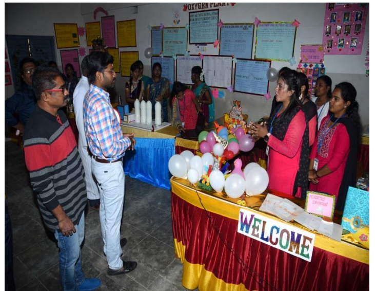
“Participants Expressing Their Ideas with Presentations”