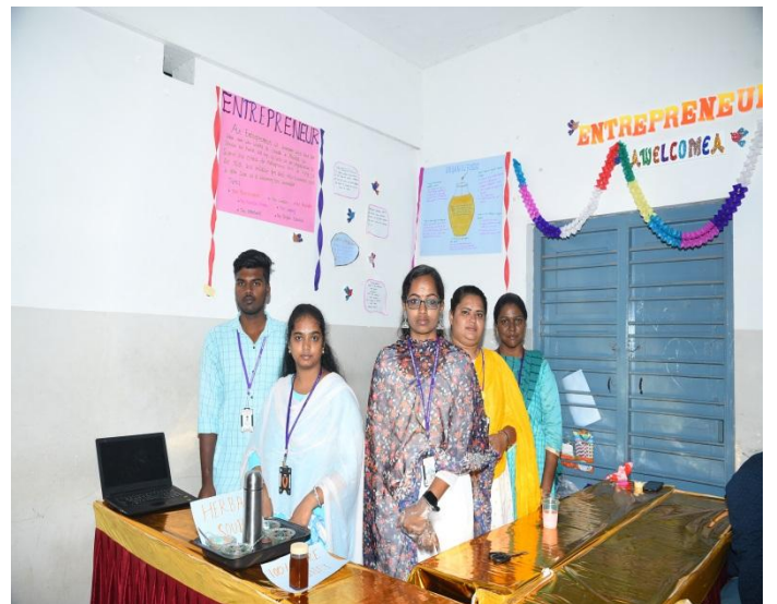
“Participants Expressing Their Ideas with Presentations”