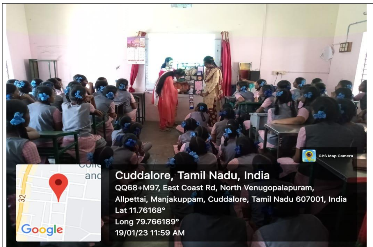
Students presenting their charts Infront of the school students