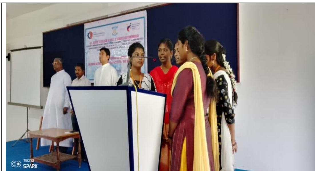
Programme starting with prayer