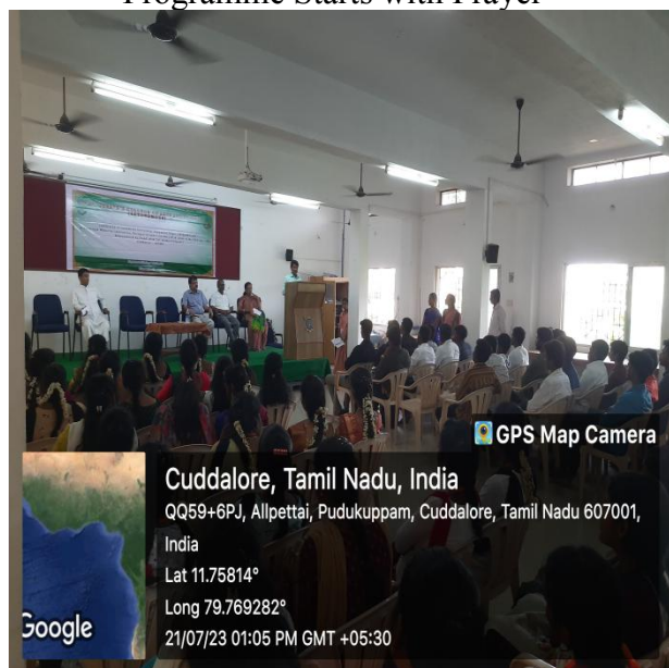
Resource Person interaction with audience