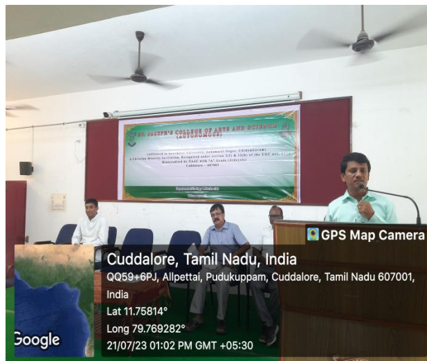
Motivation talk by Resource Person