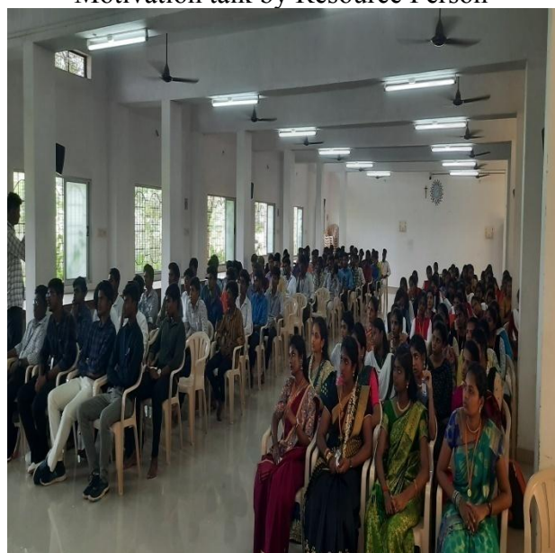
Students participants from Dept. of Zoology & Enviro club