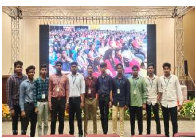
Students Participated in the Conference