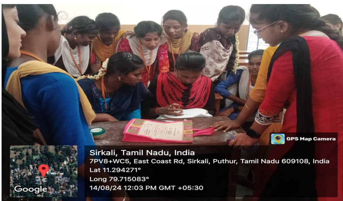
Students along with the alumni during the activity