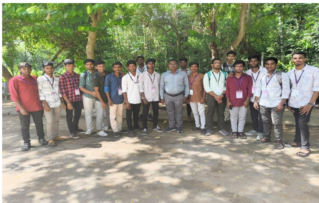
Students along with the staff at SMVEC