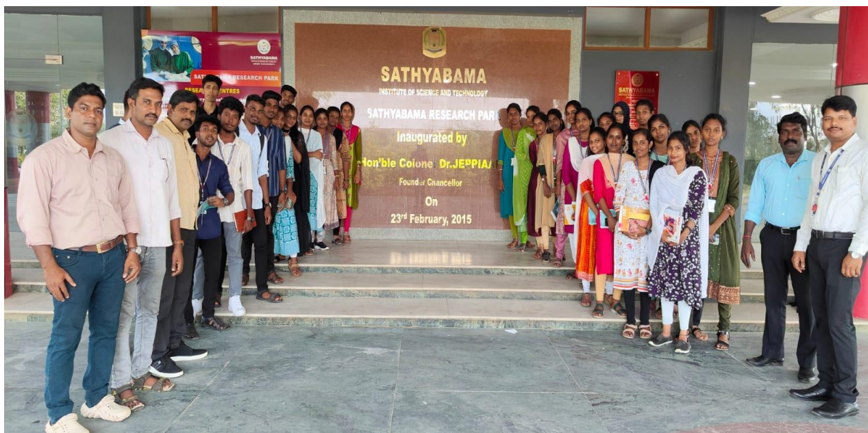
Students along with staffs in Sathyabama university