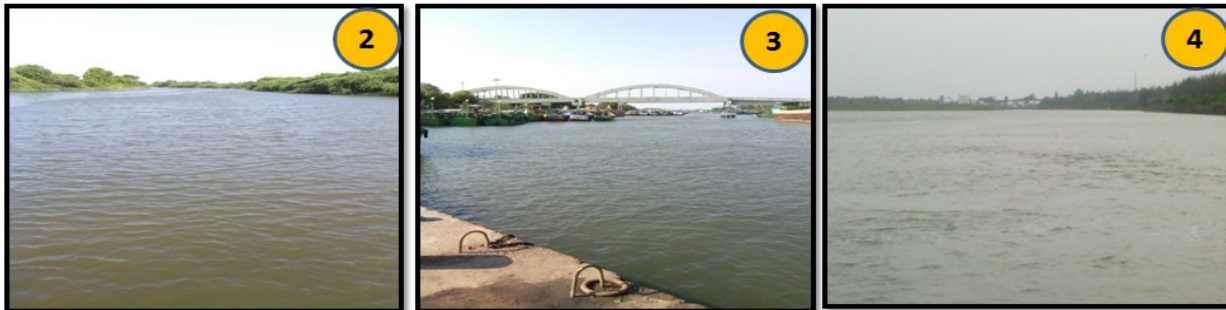
Figure-2: Region-I: Thazhanguda at the bank of River Uppanar;