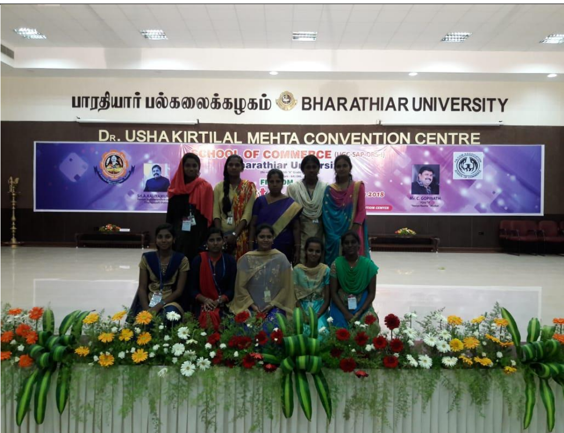
The BBA(CA) girls team before the start of the cultural events.