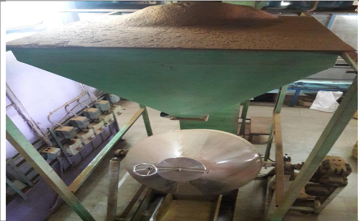
Pulverising unit to grind the tea leaves into granules and fine tea dust.