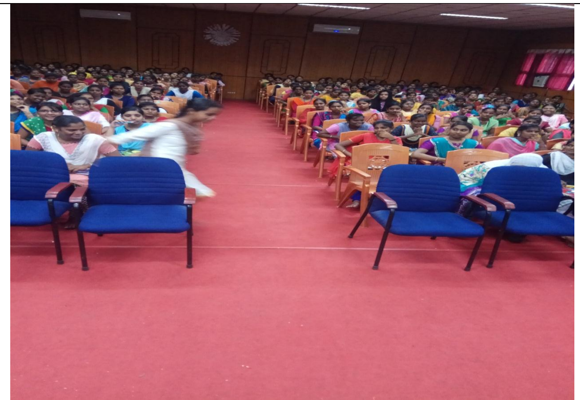
Gathering of students [SHIFT II]