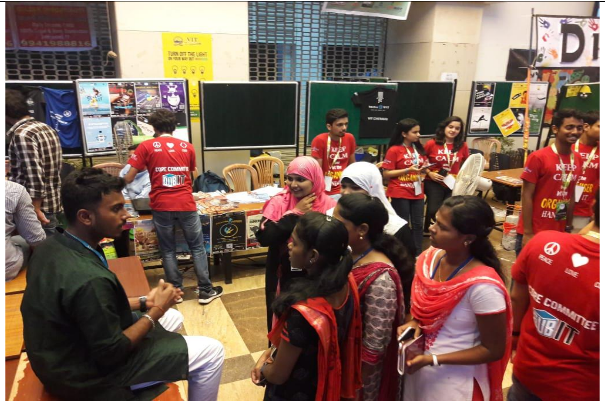
Interaction with VIT students.