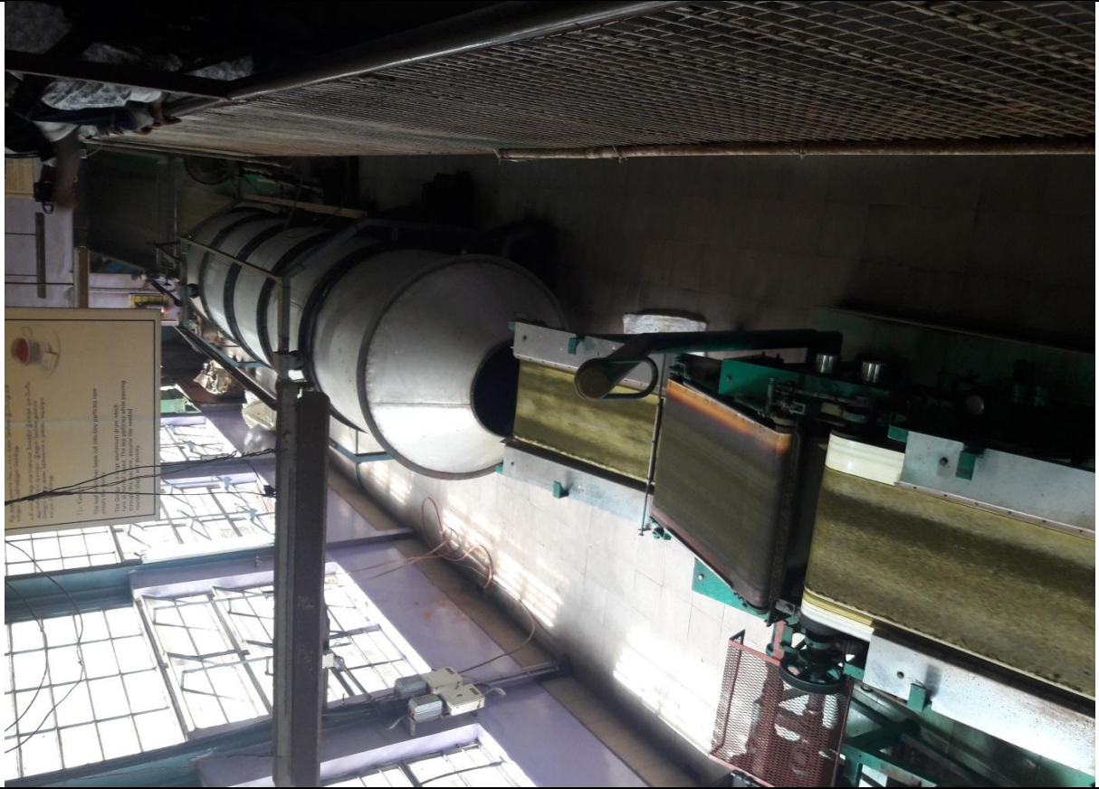
A view of moisture removing drum