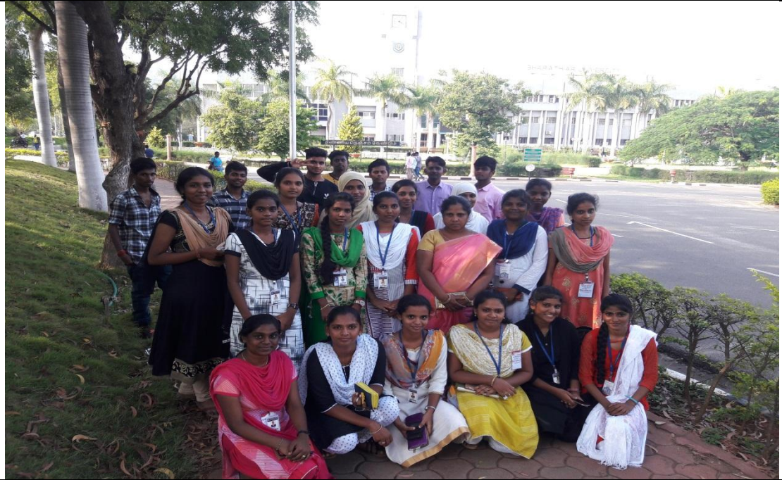
Our BBA (CA) students in Bharathiar University Campus.