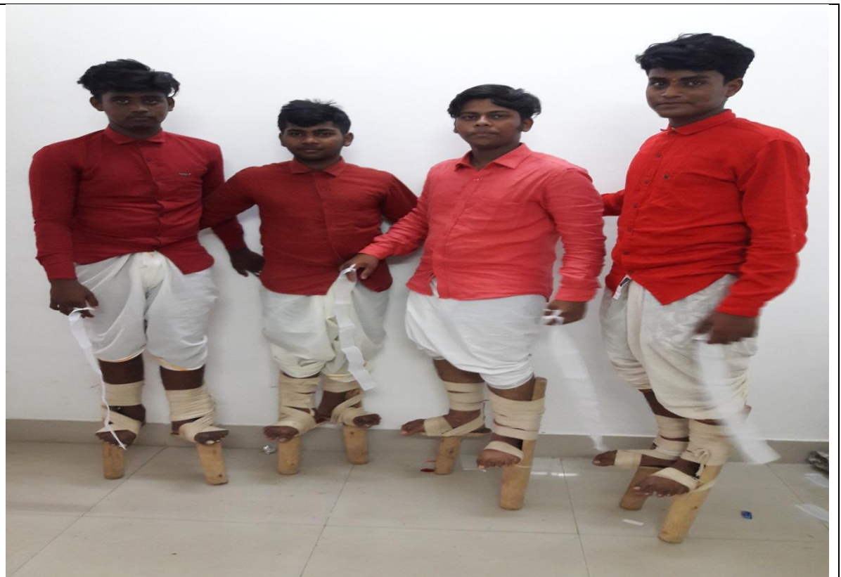
Boys Cultural Team