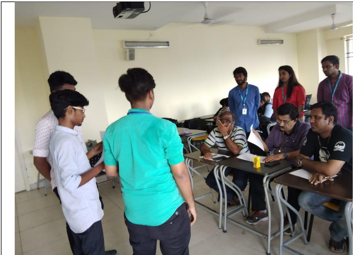
Jury members giving feedback on the presentation.