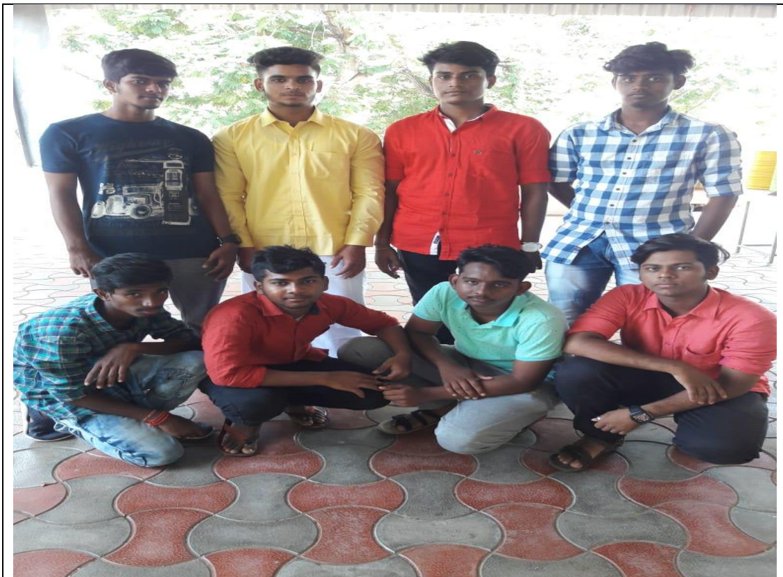
I Year BBA (CA) Boys Team