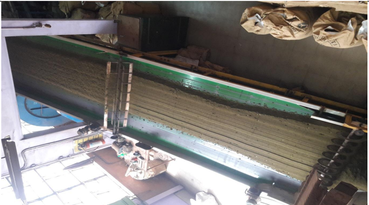
Springer unit to remove excess heat in the semi ground tea leaves coming out of the moisture removing drum