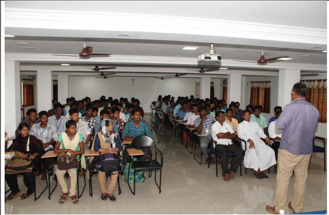
Gathering of students [SHIFT I]