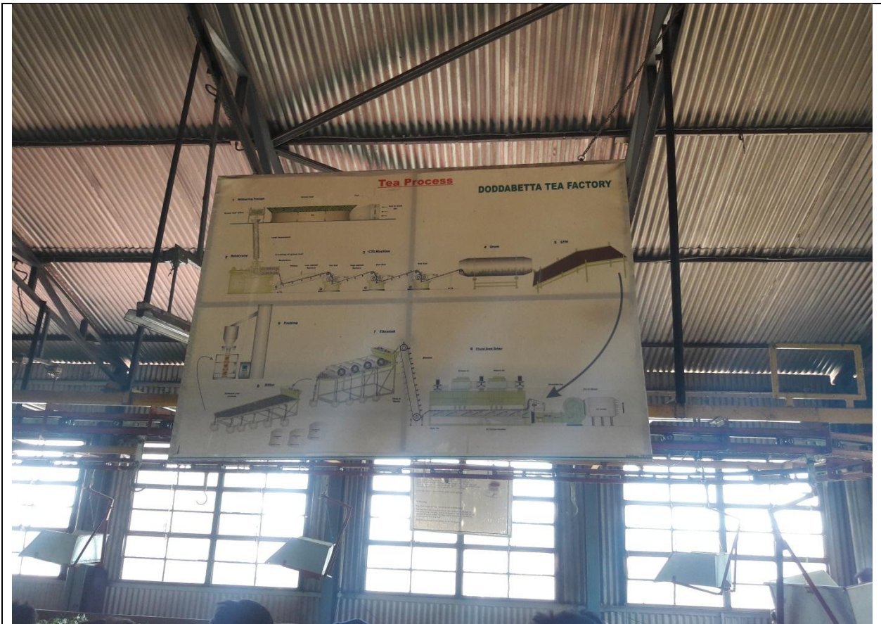
A display inside the unit portraying the tea making process.