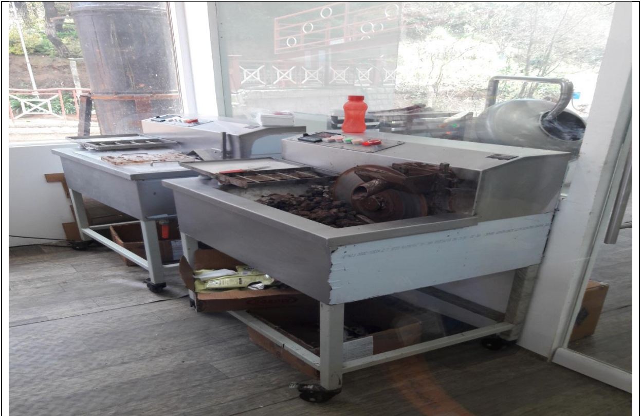
Chocolate making unit