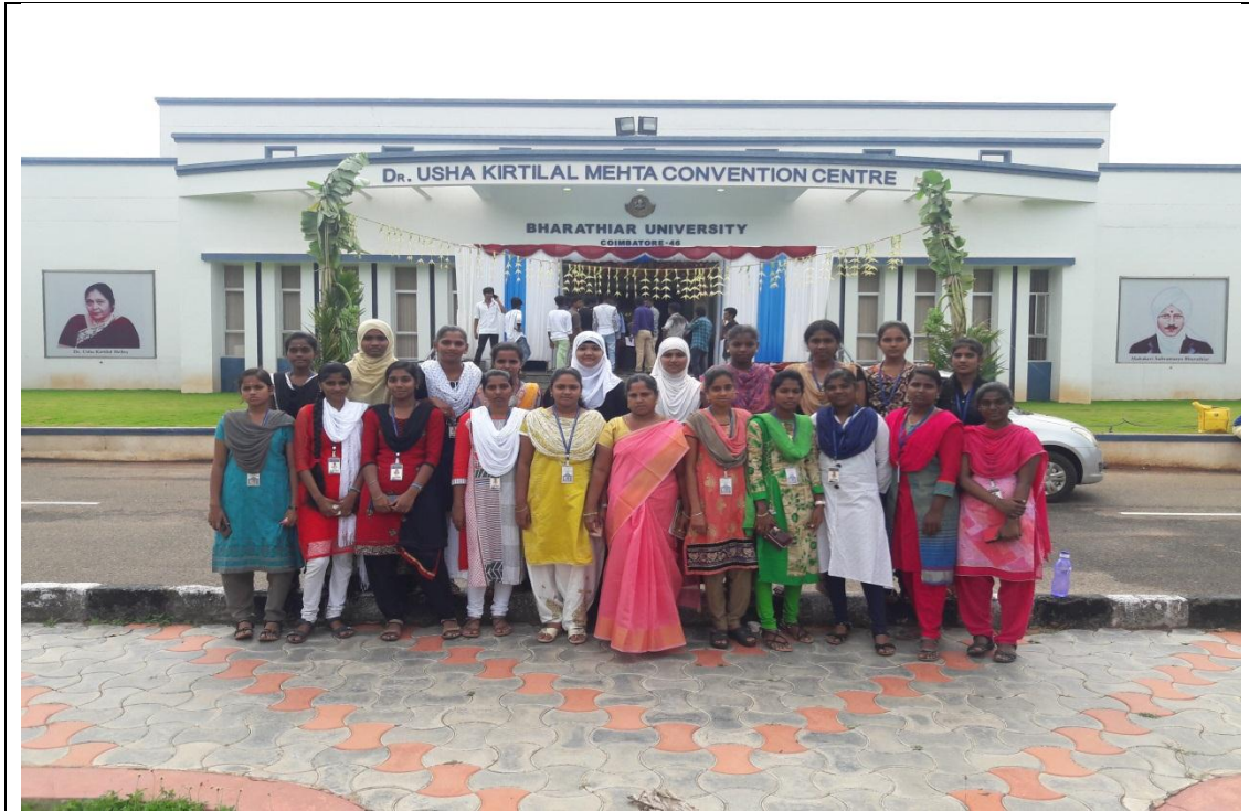
I Year BBA (CA) Girls Team in front of the convention centre.