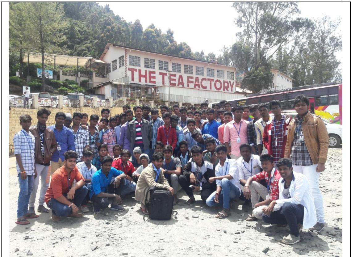
I Year BBA (CA) students in front of the tea factory.