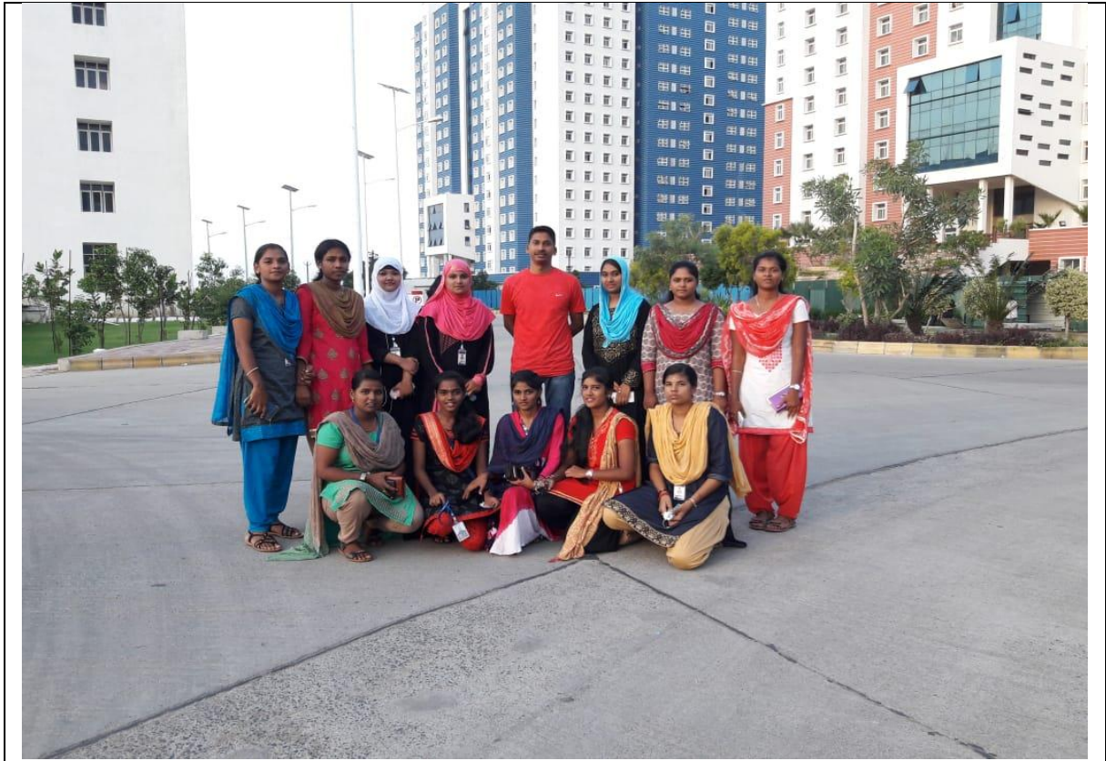
I Year BBA (CA) Girls Team