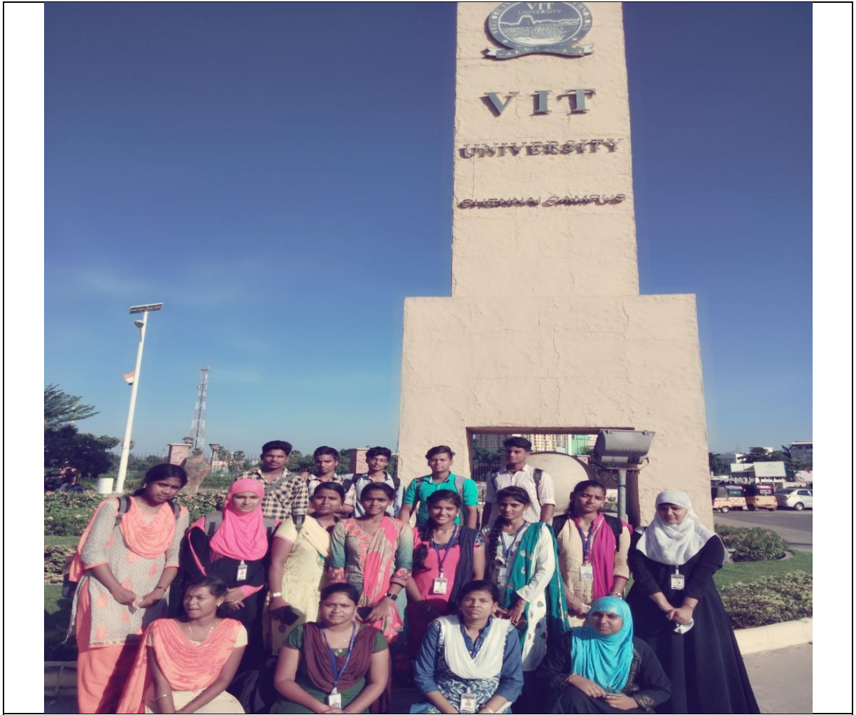
I Year BBA (CA) students in the VIT, Chennai Campus.