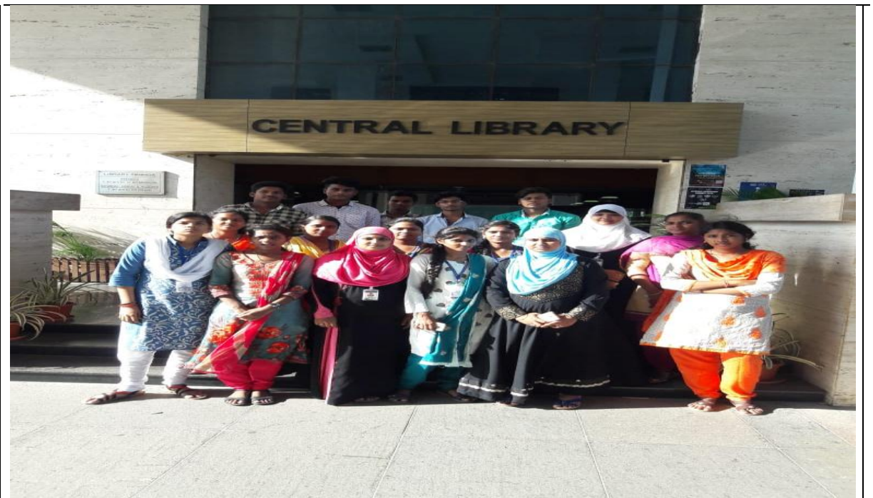
Our students in front of the Central Library, VIT University, Chennai Campus.