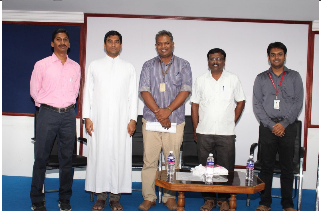
Staff members of Department of Commerce (Bank Management) & BBA(CA) along with the resource person. [SHIFT I]