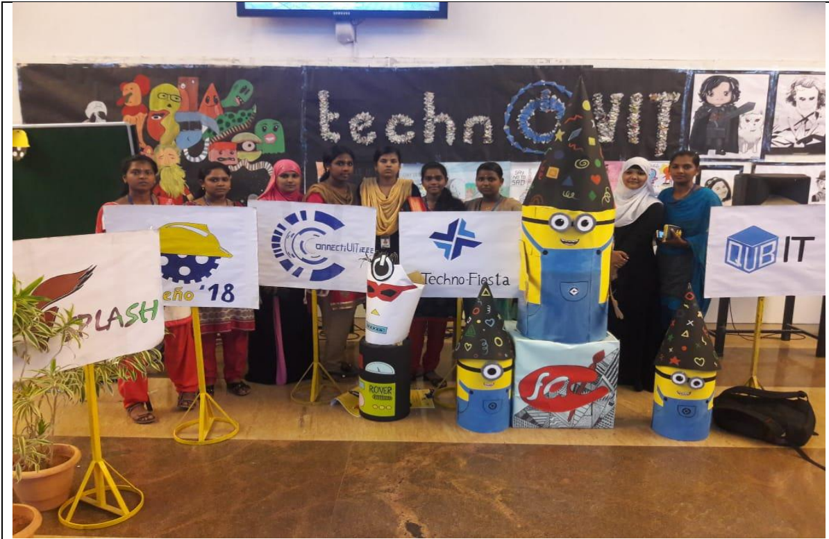
Our student's performance in the fun zone.