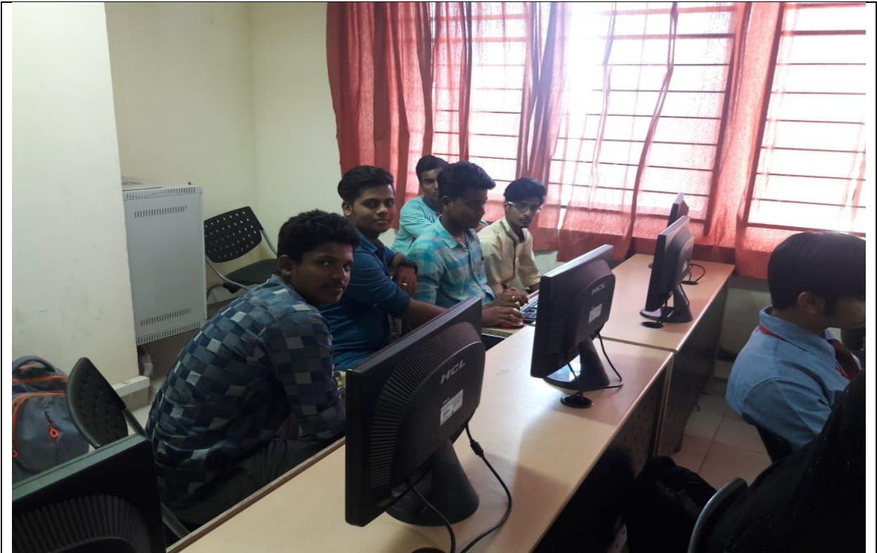
The BBA(CA) boys team during the Business Analytics & Web Analytics Workshop.