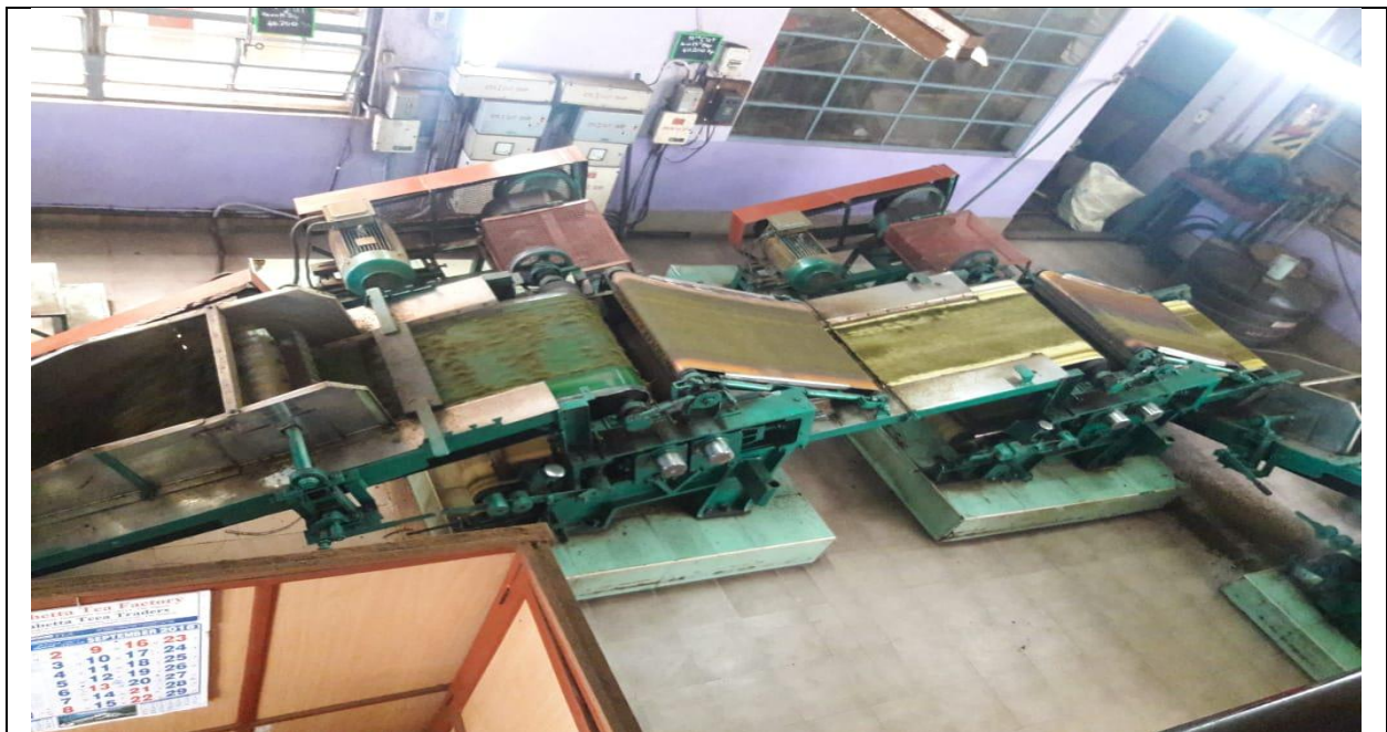
Tea leaves cutting unit