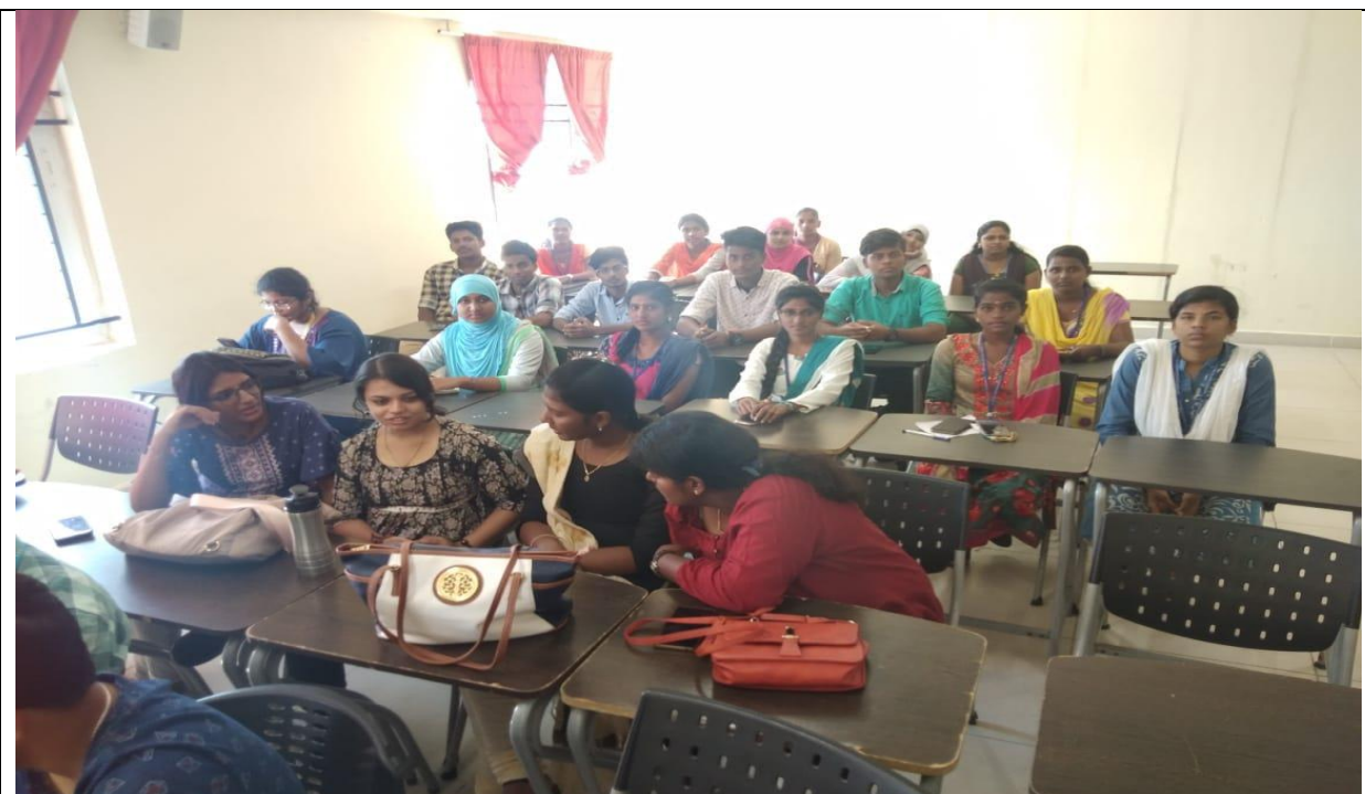
Our student's participation in the Workshop. (Introduction to Stock Market by SEBI)