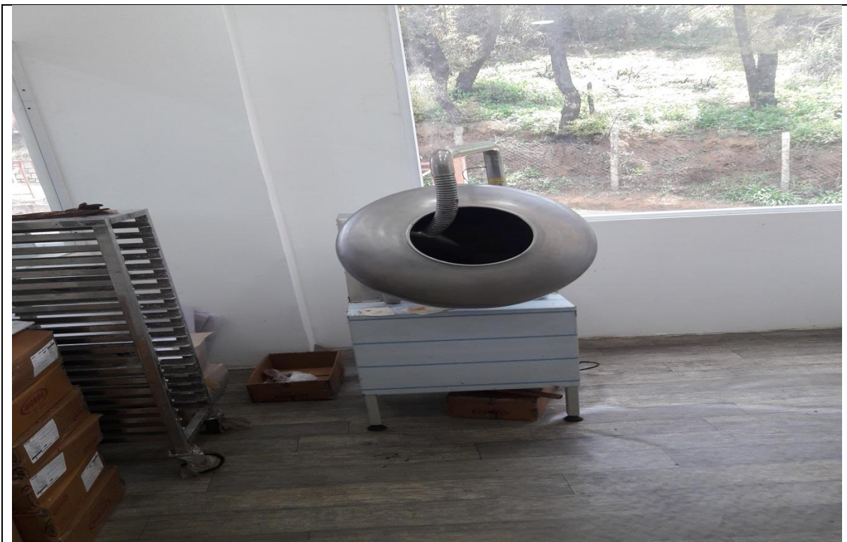
Functioning of chocolate blender