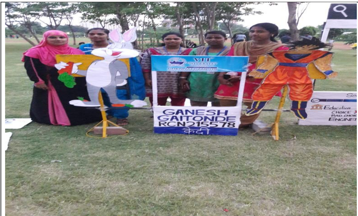
Our student's performance in the fun zone.