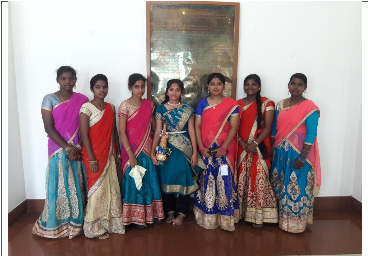
Girl's Cultural Team