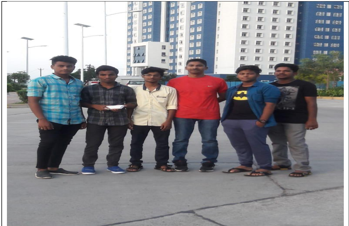
I Year BBA (CA) Boys Team