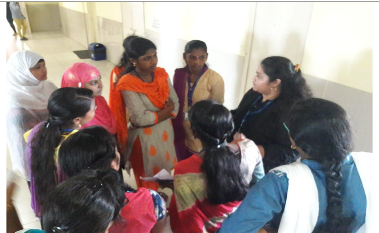
Interaction with a MBA student.