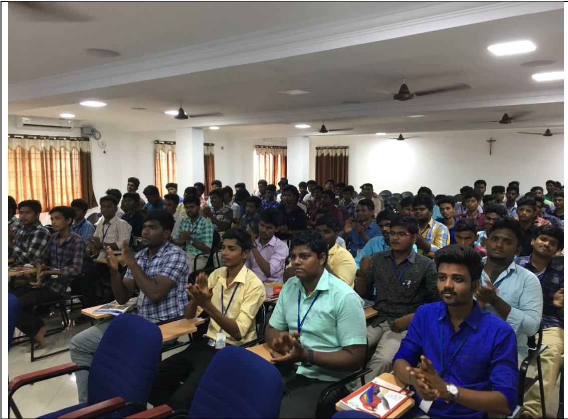
Thanks giving applause at the end of training session.