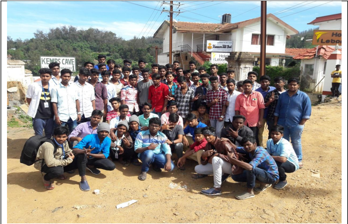
I Year BBA (CA) students in front of the tea factory.