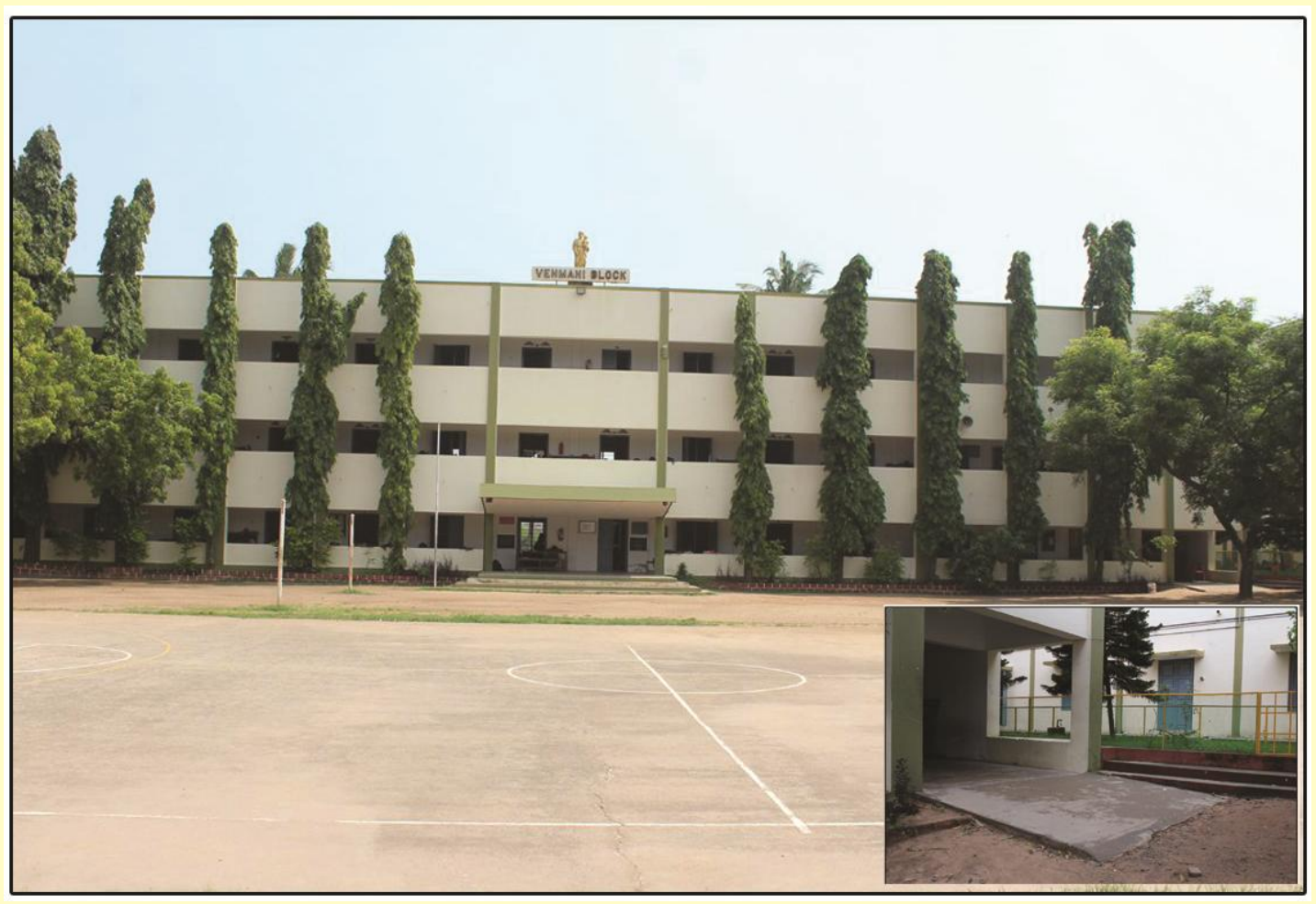
Ramp available at Venmani Block