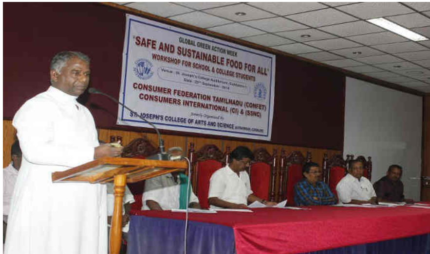
Rev.Fr.Secretary , Delivering the Inaugural Address