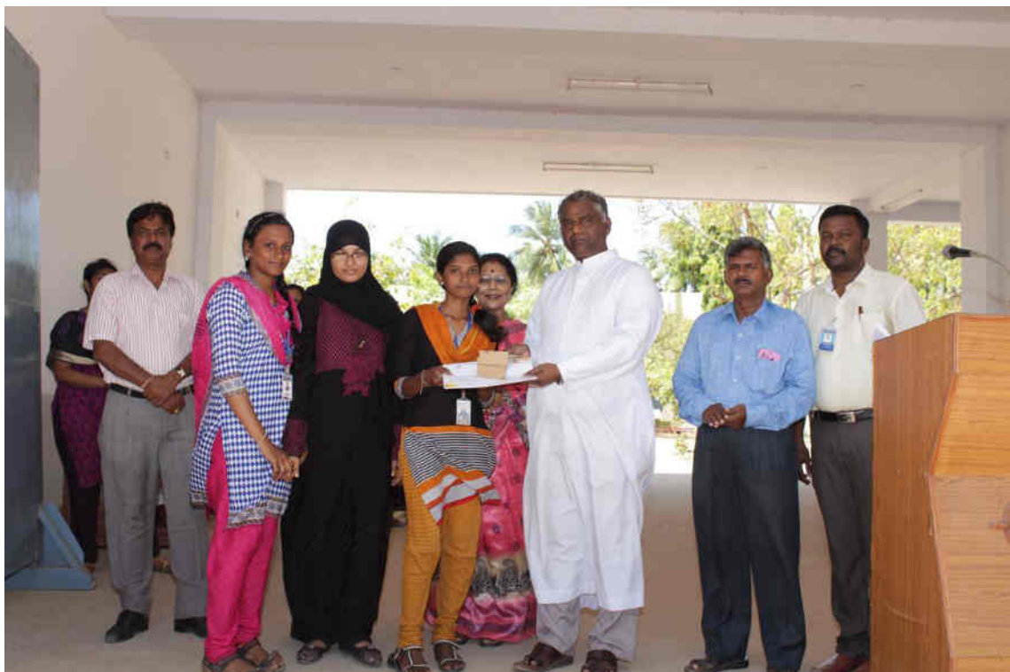
Honouring the Prize winners– Shift II

The student's participants were really involved in the Poster Presentation and displayed their talents. The Poster Presentation session was interesting and more informative. The Non participants from all the classes viewed the Poster presentation and acquired knowledge .Finally the prize winners were honoured with Certificates and prizes in the Common Assembly.