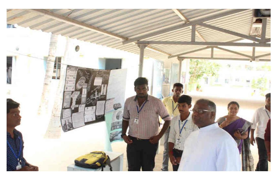
Display of Talents by the Shift I Students