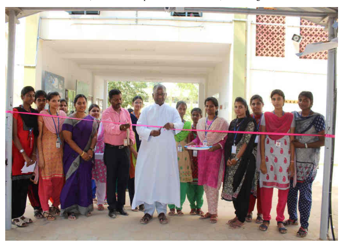
Rev.Fr.Secretary Inaugurating the Poster Presentation Competition (Shift –II)