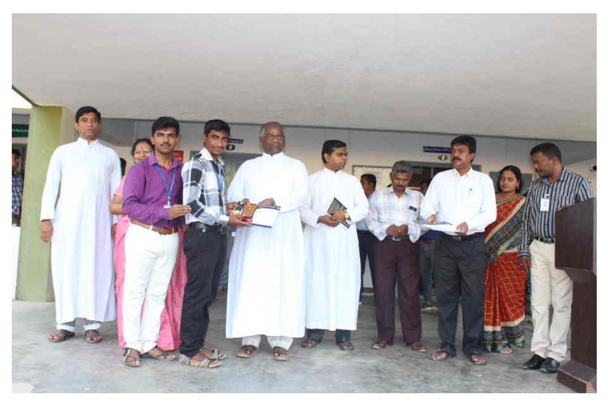
Prize Distribution to the Shift I Students in Assembly