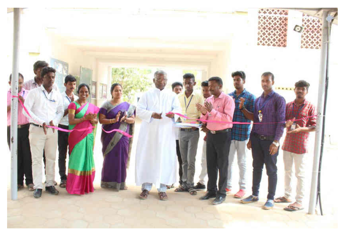
Rev.Fr.Secretary Inaugurating the Poster Presentation Competition (Shift – I)