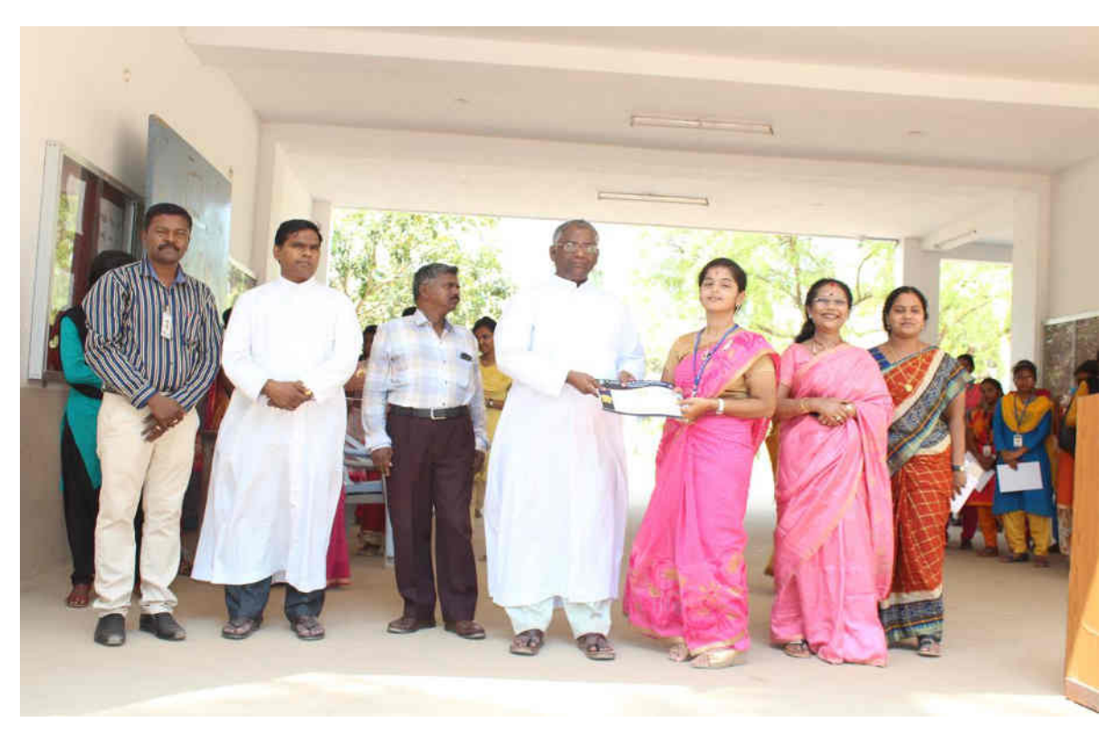
Prize Distribution to the Shift II Students in Assembly