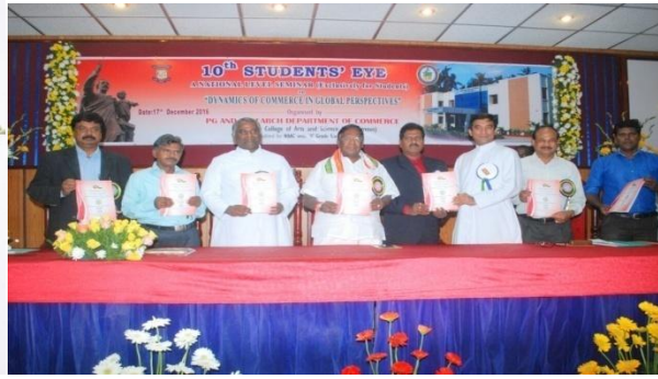
Release of Souvenir By The Chief Guest Shri. N. Narayanasamy, Hon'ble Chief Minister of Puducherry

The students of shift I & Shift II participated in the Inter Departmental Cultural Competition conducted in our College on 21 st & 22 nd December 2016 and won prizes on various events.