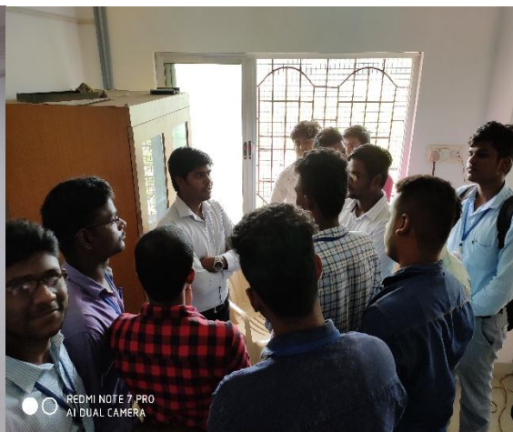
Participants Discussed with the Resource Person