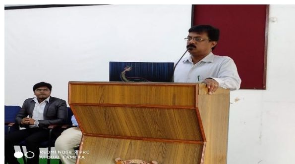
Welcome Address by Our HOD