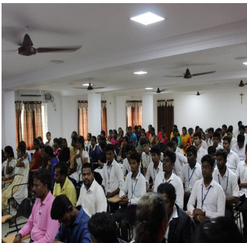
Participants in the Sessions

He also talked about how Python used for data science tools like SciPy, Numba, Cython, Dask, Vaex...etc. He discussed about CIPy has long been useful for providing convenient and widely used tools for working with math and statistics and also about Numba lets Python functions or modules be compiled to assembly language via the LLVM compiler framework. Finally, he discussed about Cython it transforms Python code into C code that can run orders of magnitude faster. This transformation comes in most handy with code that is math-heavy or code that runs in tight loops, both of which are common in Python programs written for engineering, science, and machine learning... etc.