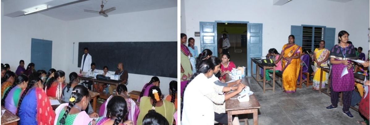
Checking up the students height, weight and blood pressure

As a part of sequence of events conducted by JOSEBYTE Association an wonderful session led by Mahatma Gandhi Medical College And Research Institute students on 10th January 2017 Shift-II.