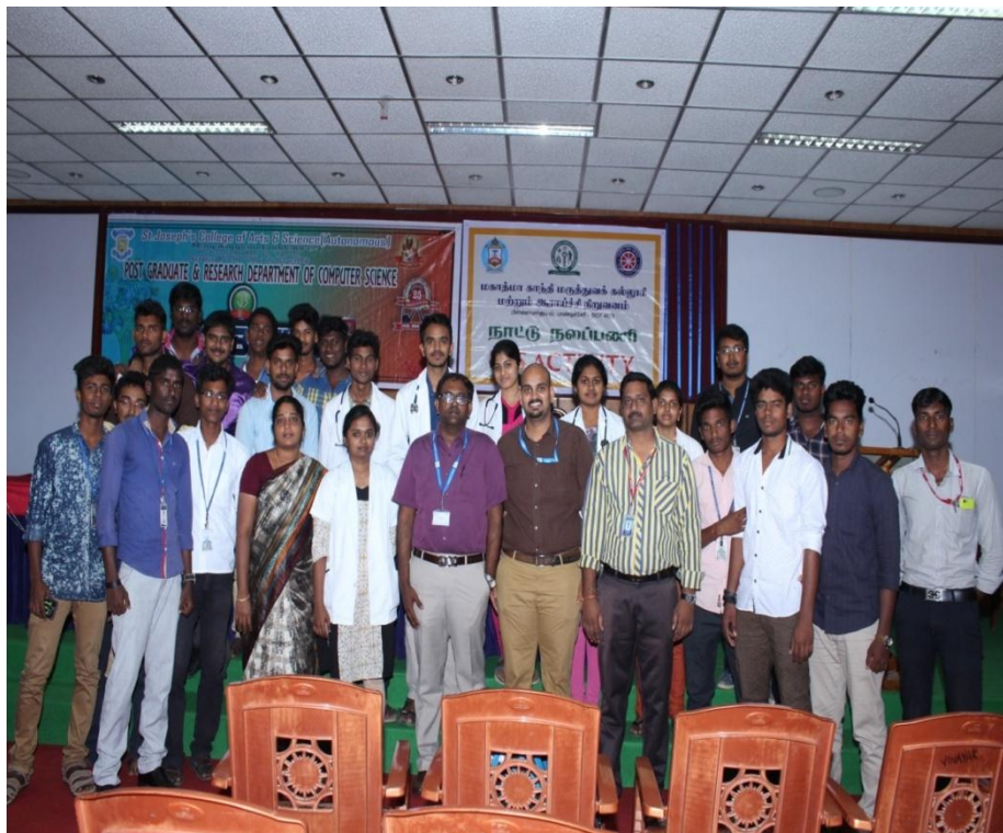
Organizing team with Josebytes Association