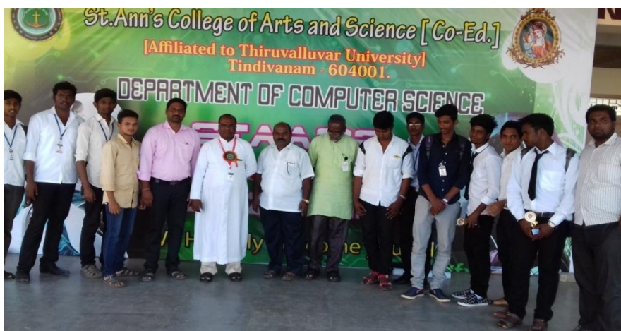
Our winners with Rev.Fr.Secretary & Principal of St. Ann's College of Arts and Science