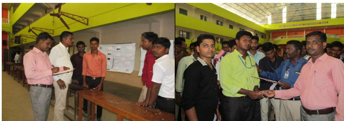
Judges were evaluating the student's presentation & distributing the prizes to the winners