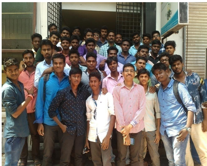
Industrial Visit team with the staff members