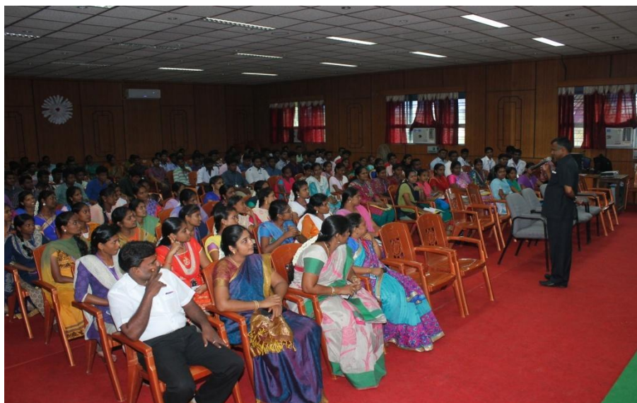
The resource person interact with our Participants

tips to motivate students to be great innovators in this field. He also gave prizes to some students for their smart and quick answering