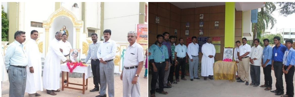
Tribute to Dr.A.P.J Kalam with flowers by Rev.Fr. Secretary, principal, Dean of Studies, HOD and Staff members.

As a tribute to our dream hero Dr. A. P. J Abdul Kalam , who taught us to dream we organized many programs in remembrance of him. The programs were started with honoring the photo of Dr.A.P.J Kalam by Rev.Fr. Secretary and other important personalities in front of the office and the Ruby Jubilee Block.