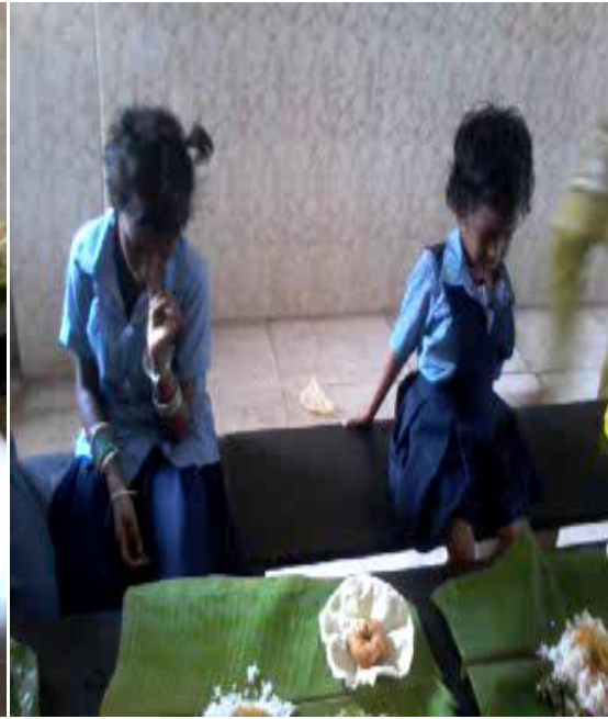
Food provided for the students

After the lunch, the following events were conducted. Speech, singing, balloon burst, musical chair, secret treasure, identify the fruits.