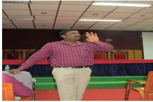
Prize distribution and an inspiration speech by chief-guest.