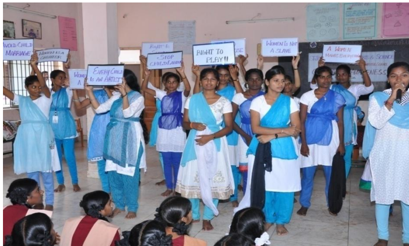
Street play performed by our Students

. The first year students of shift II performed as street play named ‘just be you’ on child abuse. The street play highlighted women education, child marriage and women’s rights.