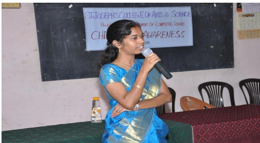
Dr.R.KALAIARASI address about Child Abuse and Child Rights

The energetic buds of shift II of our department organized an awareness program on CHILD ABUSE on 04.10.2016 in the SEVAI ILLAM, SEMMANDALAM. The awareness program as blessed with the presence of honourable chief guest Dr.R.KALAIARASI (Psychiatrist) in Government Hospital, Cuddalore.