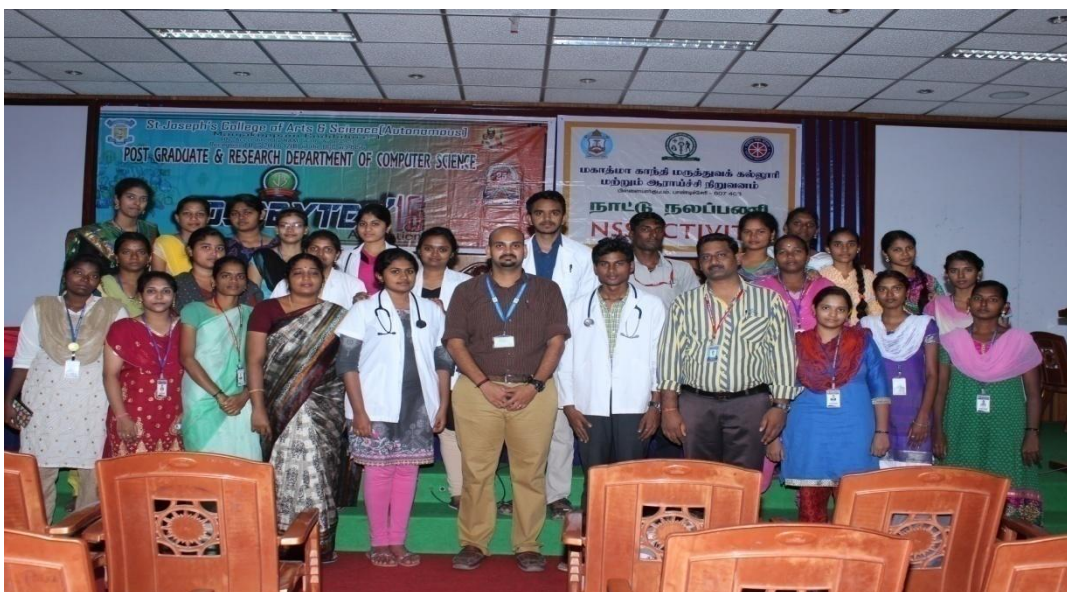
Organizing team with Josebytes Association

They explained the problems suffered by our heart due to certain causative agents of various non contagious diseases such as on balanced diet, consumption of junk foods etc. He also instructed us not to be stranded into such diseases without consuming a balanced diet with the help of video lecture. The causes, symptoms, diagnosis, treatment and prevention of non-contagious disorders and diseases .They said that although there is inappropriate cure over such diseases we must get on to the saying prevention is better than cure and act accordingly.