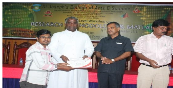
Certificate given to the participants by our Rev.Fr.Secretary