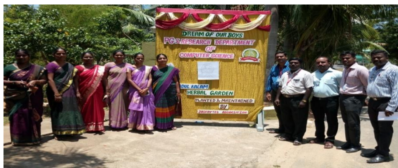
Staff Members in the Dr. A. P. J Abdul Kalam Herbal Garden