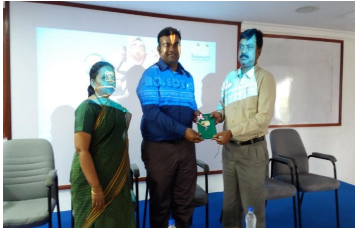
Our H.O.D Honouring the resource person.

A Novel initiative was made by the DEPARTMENT OF COMPUTER SCIENCE and JOSEBYTES Association through conducting seminar on software engineering and project development to the PG students on 25 th November 2016 .