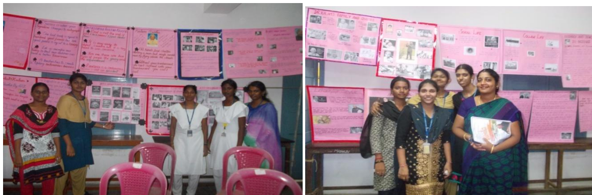
Poster Presentation of shift-II girls on tribute to Dr.A.P.J. Abdul Kalam.

Shift II conducted a exhibition based on Dr. A. P. J Abdul Kalam , Many students presented their posters based on the life of Kalam. There was also a Poster presentation on the life of Dr.A.P.J. Abdul Kalam .