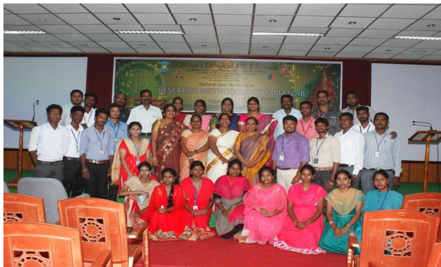
Resource Person with Organizing Team

The afternoon sessions were started by 2.00 P.M. In this Sessions the topic discussed on Programming Techniques, Image Processing toolbox. The last section of the day about Data Mining Tool Box and Fusion toolbox was came to an end by 04.45 P.M.