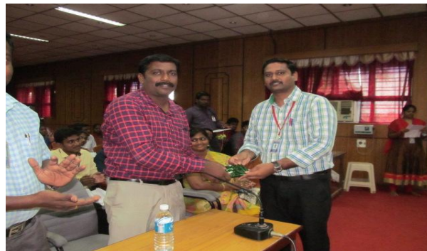
co-ordinator honoring the chief-guest.