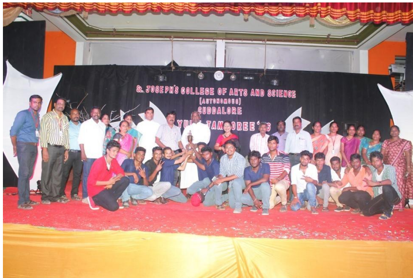
The winning overall Trophy has been given by Rev.Fr.Secretary (Shift-I)

The department of Computer Science has won the overall Trophies of both Shifts I & II.