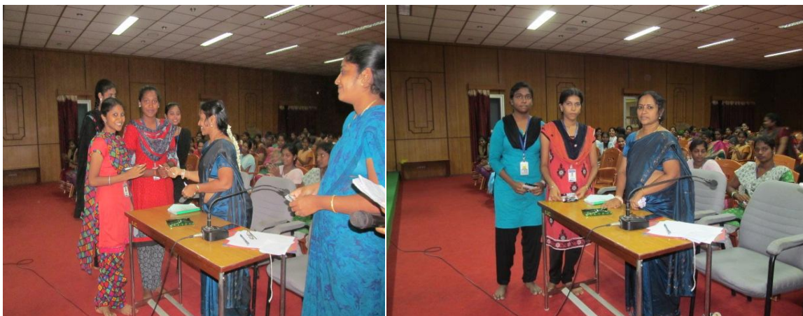
Distributed prize to the winners.