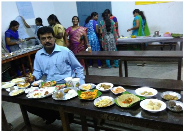
Our HOD & Staff members along with Students in the Food Festival

The PG and Research Department of Computer Science organized a Food Festival for III year Students of Shift-II. The students took ecstatic participation in the event. The students proved their talents and abilities. They cooked different kinds of foods and served the judges and the students. They cooked different kinds of Natural & Herbal foods.