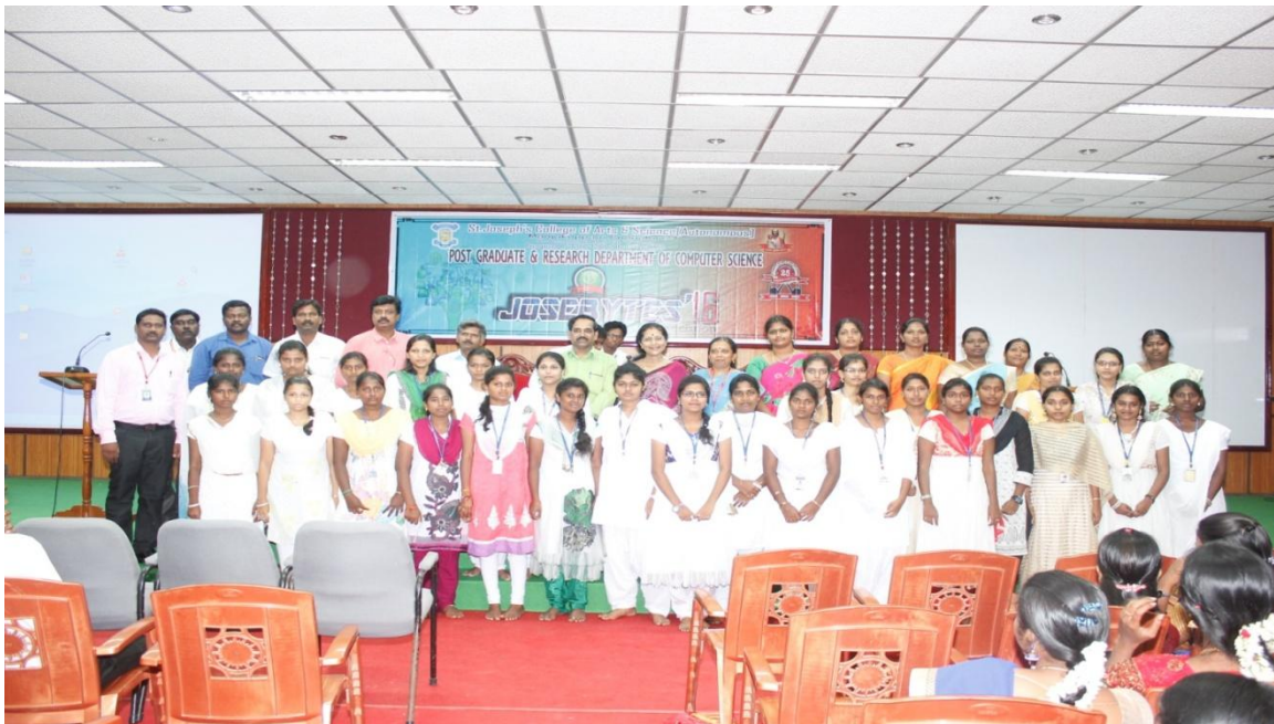
Chief Guest, HOD, Staff Members and the Office Bearers-Shift II