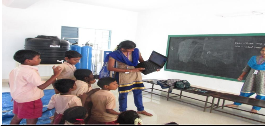
Class was taken by our Students to the Primary Children's

After teaching basics of computer, Questions were asked about computers and the students responded well for all the questions asked by students and prizes were distributed to the students who answered. Then games were conducted to the school students.