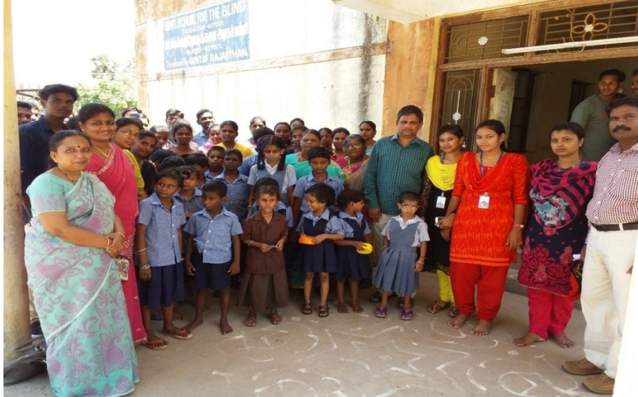
Government School for the Visually Challenged Children, Cuddalore

Finally our Staff members take a group photo along with the students and staff members of that School.