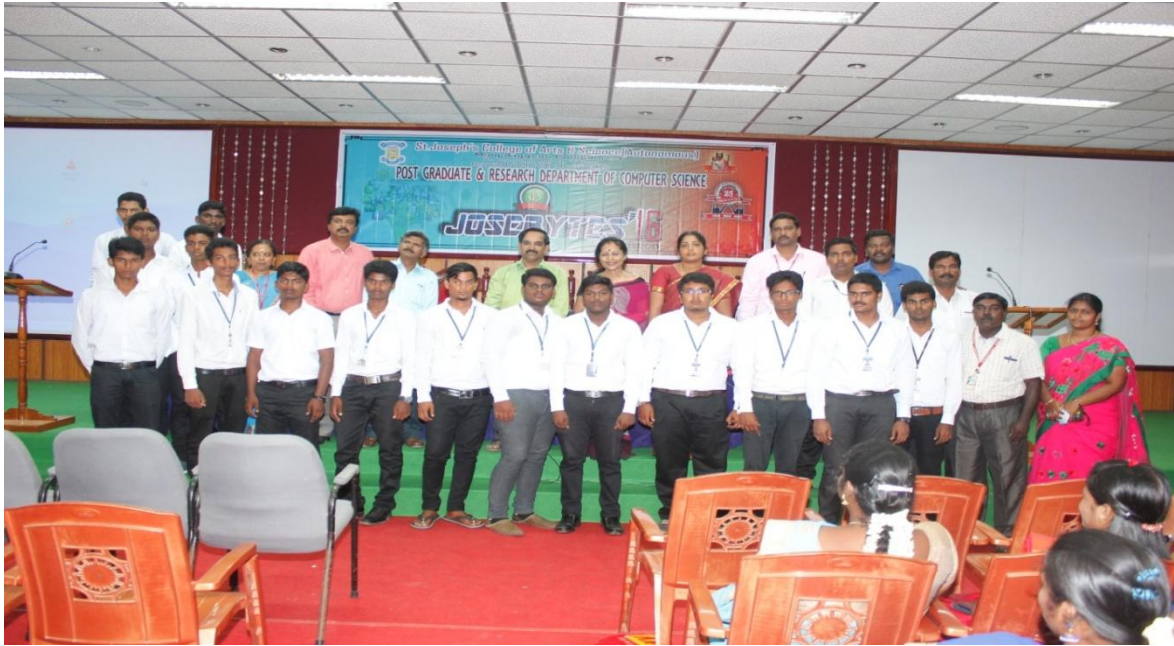
Chief Guest, HOD, Staff Members and the Office Bearers-Shift I