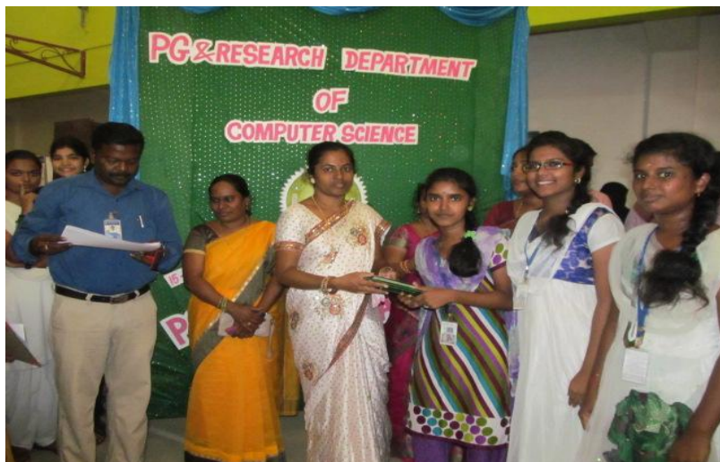
Distributing the prizes to the winners.

There were 10 teams from 1 st UG, 10 teams from 2 nd UG and 10 teams from 3 rd UG, 90 students from shift II participated in this event.