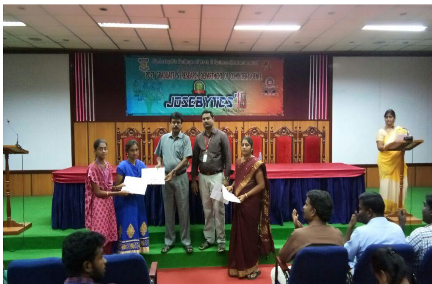
The Certificates and prizes were distributed to the prize winners for various activities & events conducted through-out the Academic year