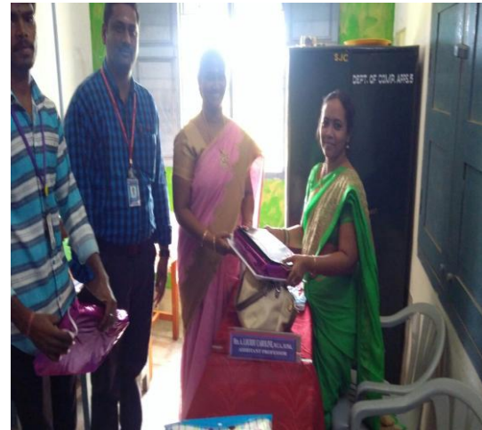
Memento given to all the Women staffs members of CS & BCA