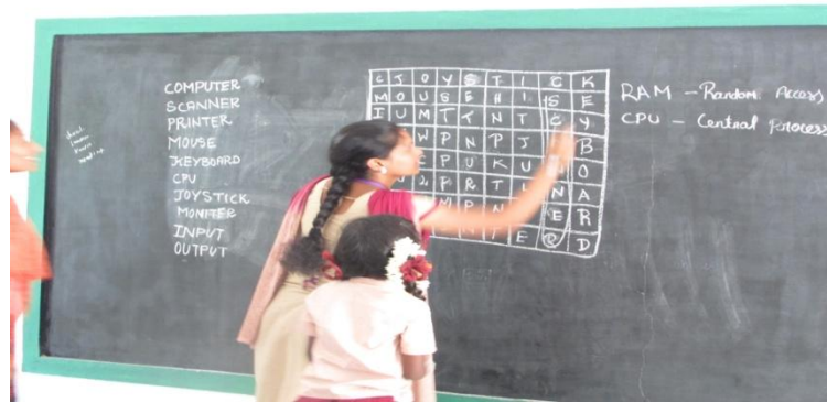
Questions were asked about computers to the Children's

After teaching basics of computer, Questions were asked about computers and the students responded well for all the questions asked by students and prizes were distributed to the students who answered. Then games were conducted to the school students.