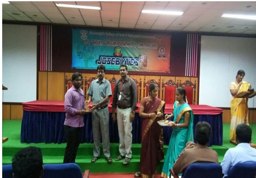
Shield given to the Achiever in the Josebytes Association