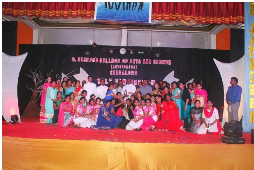
The winning overall Trophy has been given by Rev.Fr.Secretary (Shift-II)