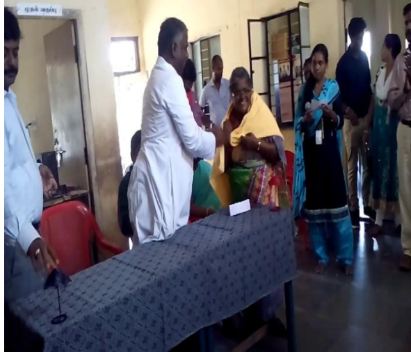
Rev.Fr. Honouring the HeadMaster