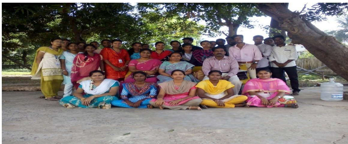
Our Students with Staff Members

Then on behalf of our scientist DR. A.P.J ABDUL KALAM we planted some trees for their remembrance of our scientist and the first plantation was done by our Rev.Fr. Secretary , and then followed by our department staffs and students.