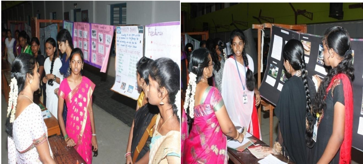
Judges were evaluating the student's presentation

PG and Research Department of Computer Applications to judge the posters created by our students.