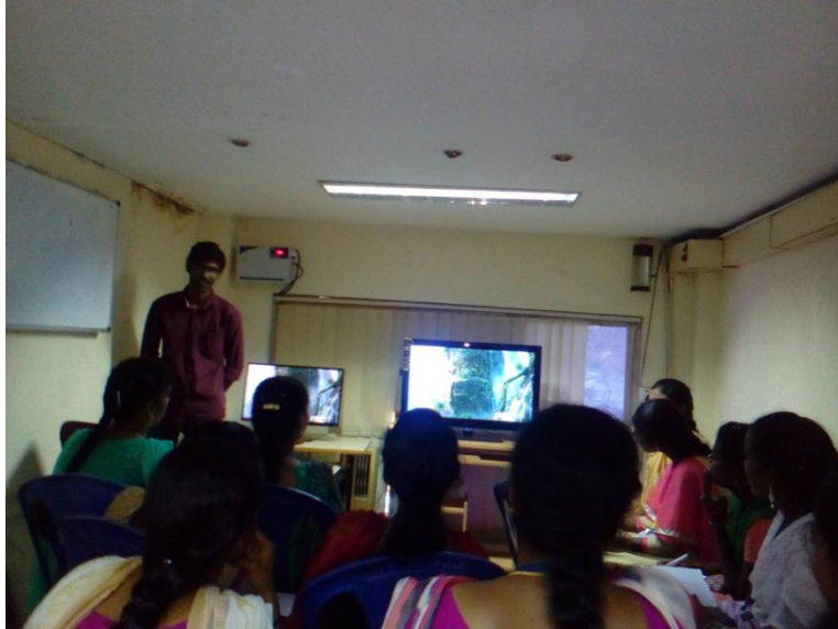
Students in the Training Lab at Pentamedia Solutions