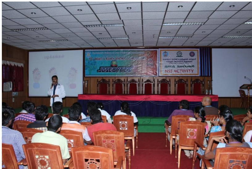
Explaining about the cardio care

They explained the problems suffered by our heart due to certain causative agents of various non contagious diseases such as on balanced diet, consumption of junk foods etc. He also instructed us not to be stranded into such diseases without consuming a balanced diet with the help of video lecture.