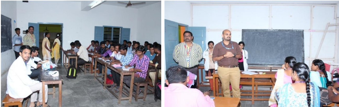
Checking up the students height, weight and blood pressure

As a part of sequence of events conducted by JOSEBYTE Association an wonderful session led by Mahatma Gandhi Medical College And Research Institute students on 10th January 2017 Shift-I.