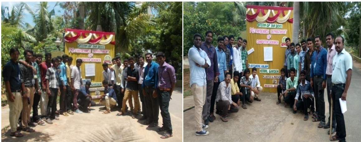
Dr. A. P. J Abdul Kalam Herbal Garden with Gardening Team