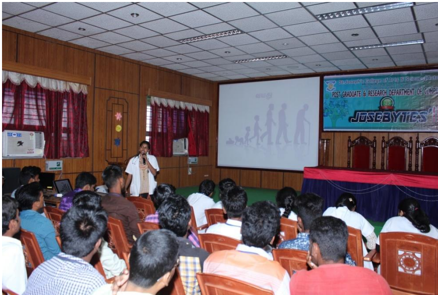
Explain about causes of non-communicable diseases

The causes, symptoms, diagnosis, treatment and prevention of non-contagious disorders and diseases .They said that although there is inappropriate cure over such diseases we must get on to the saying prevention is better than cure and act accordingly.