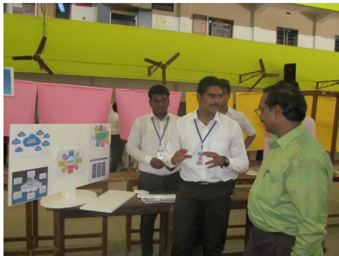
Poster Presentation viewed by Chief Guest for shift-I

There were 5 teams from 1 st UG, 8 teams from 2 nd UG, 7 teams from 3 rd UG, 1 team from 1 st M.Sc IT, 5 teams from 1 st M.Sc CS and 1 team from 2 nd M.Sc CS. 60 UG students and 21 PG students from Shift I participated in the poster presentation.