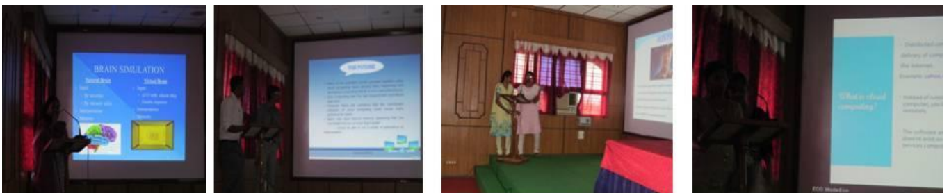
Paper presented by our students.

All the students were able to present their papers very well with the help of PowerPoint Slides and audiences were exposed to interesting facts related to Information Technology. Judges gave their best of suggestions and appreciated all the participants.