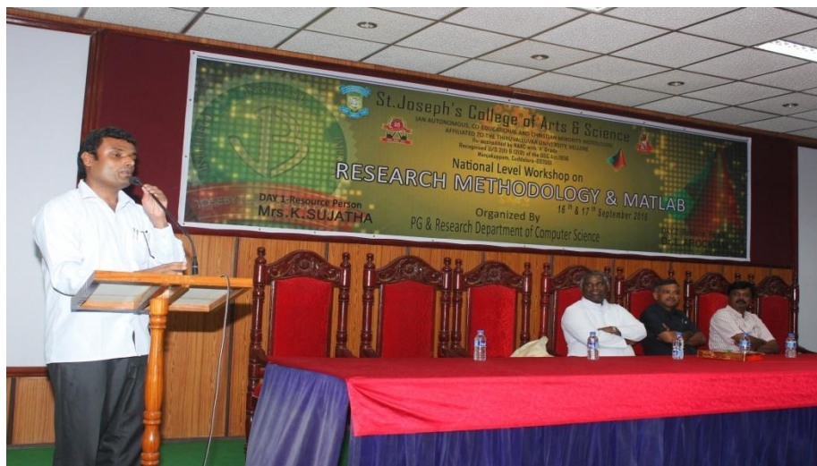
Feedback given by the Research Scholar

Our participants were requested to contribute their feedbacks on the workshop. Two of the participants had eagerly shared their feedbacks and thanked our chief guest and organizers who had made the event successful.