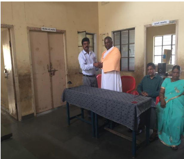
Honouring of Rev.Fr.Secretary and Our Vice-Principal.