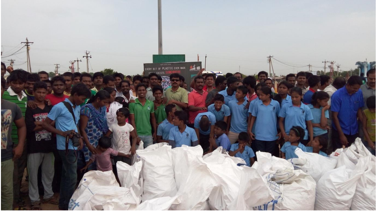
All the waste materials were hand over to the Namma Cuddalore Organization .