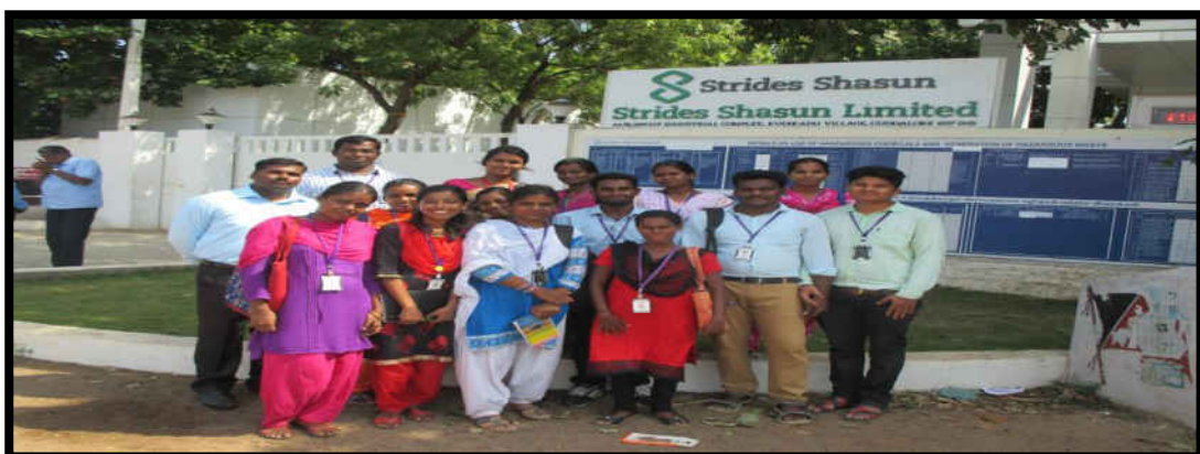
(Observation visit by I year MSW at Strides Shasun)

On 02.09.2017, I year MSW students along with two faculty members went to Strides Shasun, Kudikadu, Cuddalore for their observation visit to have exposure on industrial setting and role of Human Resource Manager in industrial setting. The trainees went for plant visit, interacted with Safety officer, Human Resource Manager and production officer. The trainees gathered lots of information from Human Resource Manager about their role in industry setting. It was very useful for the trainees to acquire knowledge regarding the industrial setting.