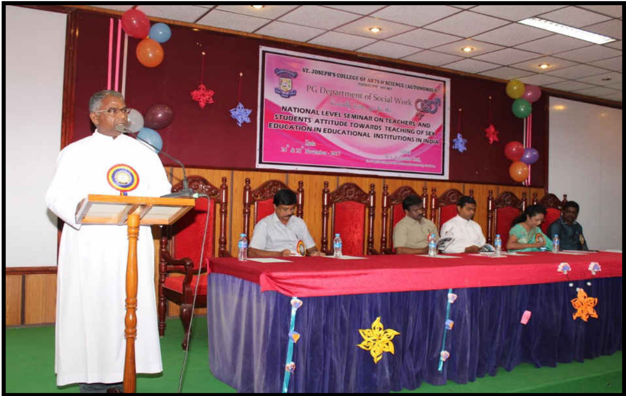
(Presidential address was given by Secretary)