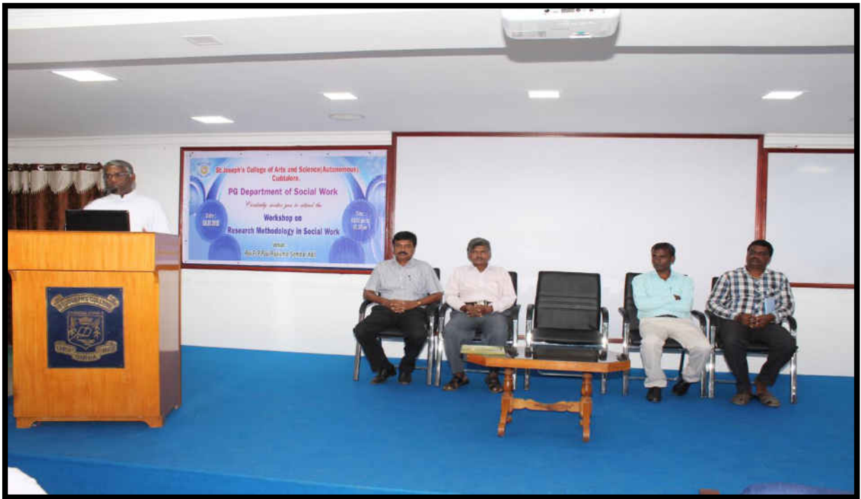
(Rev. Fr. Secretary gave presidential address)