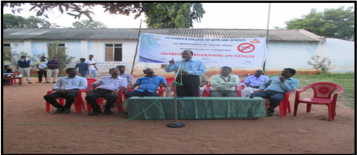
(Inspiring Speech by Chief Guest)