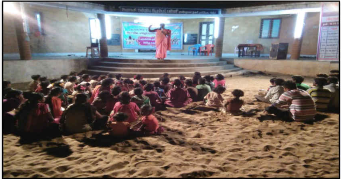
The resource person gave inspiring speech

Session VI : Awareness Programme on Health and Hygiene Date : 21.09.2017 Time : 6.00 – 8.00pm Venue : Shanmuga Nagar, Parangipettai, Chidambaram Taluk, Cuddalore.