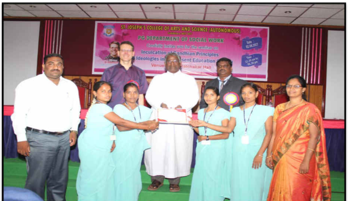
(Certificate distribution to the participants)