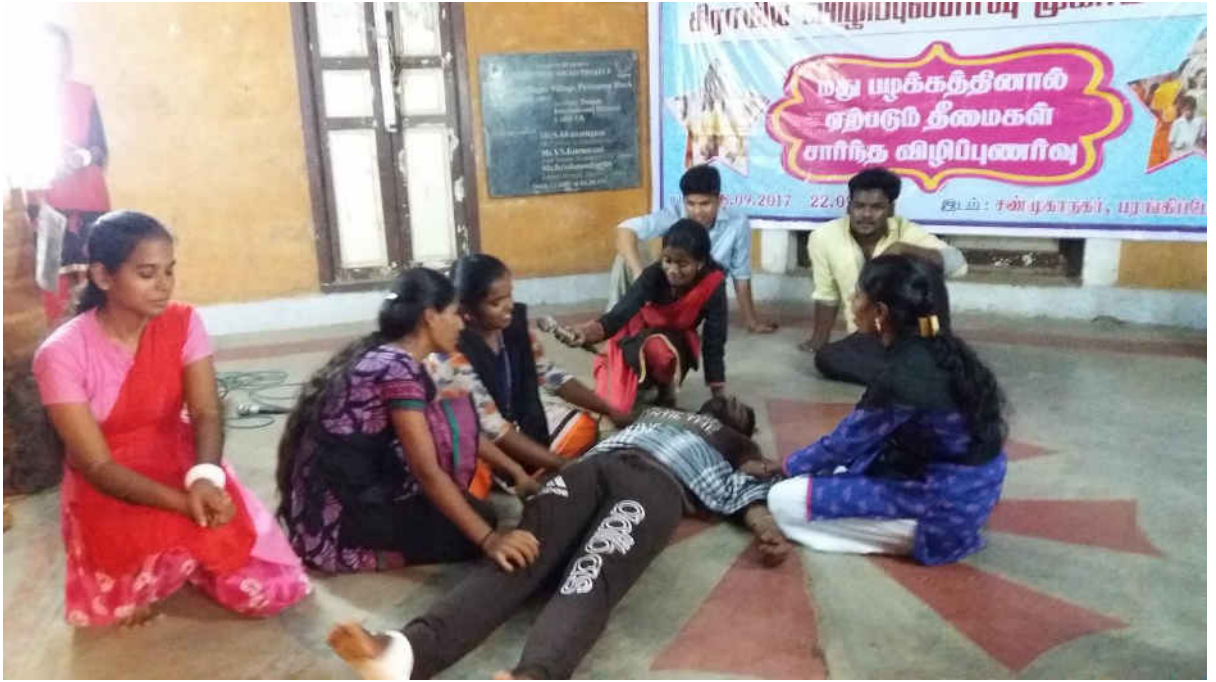
(Students performing street play on bad effects of alcohol consumption)

Session IV : Programme on Tree Plantation