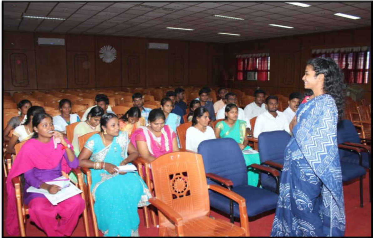
(Resource person interacted with students)