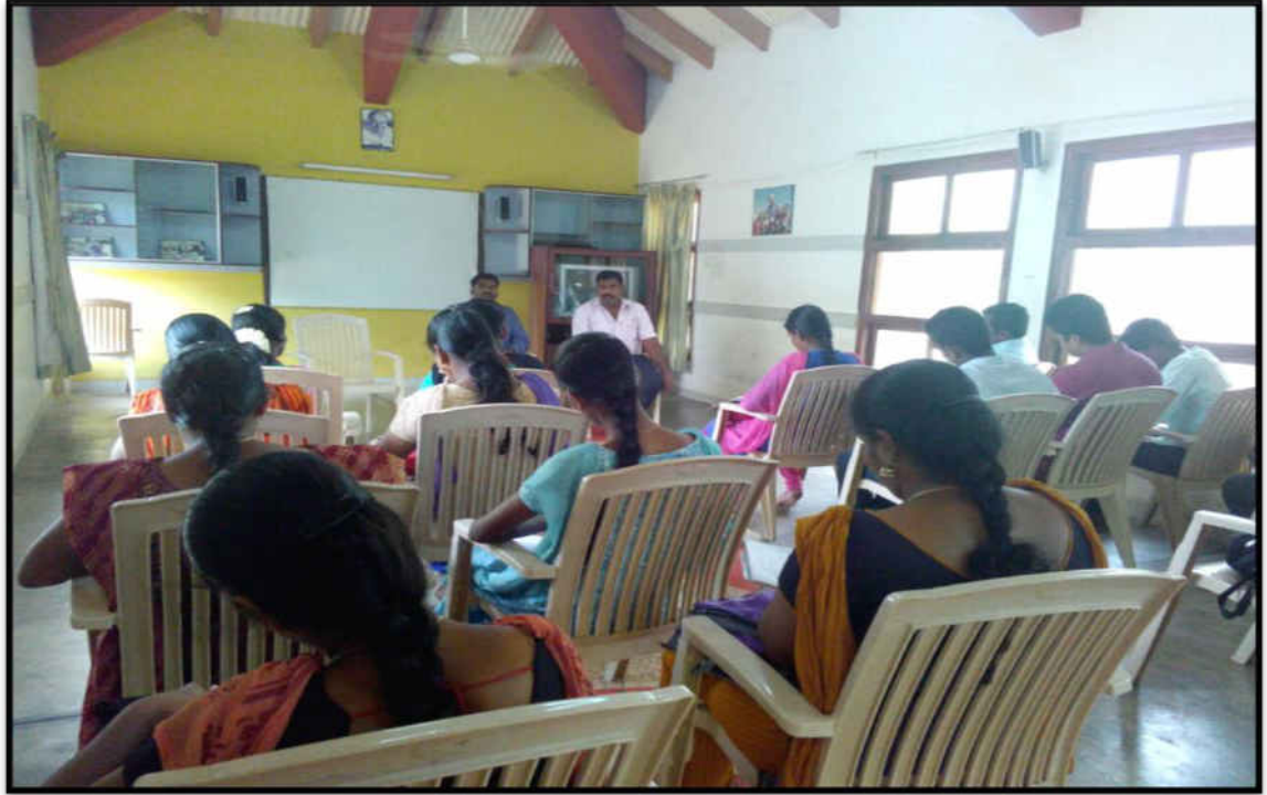
(The village supervisor interacted with the I MSW students)