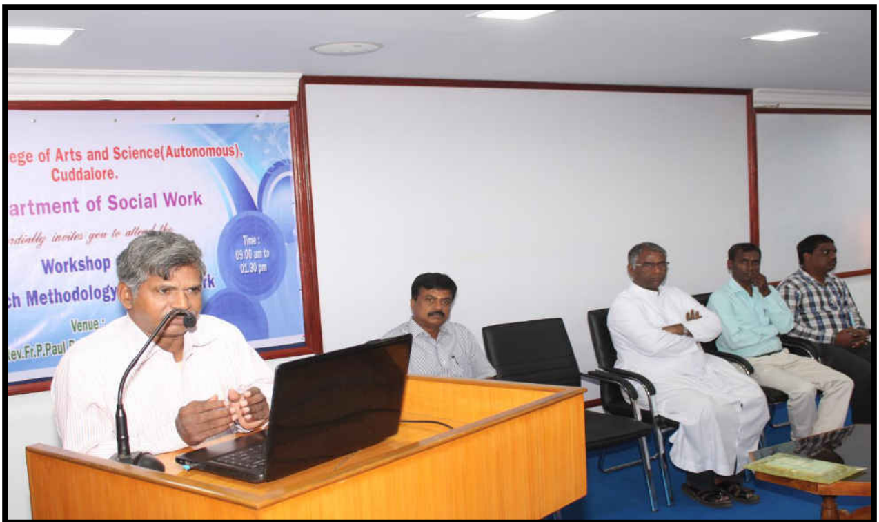
(Principal felicitated the gathering)