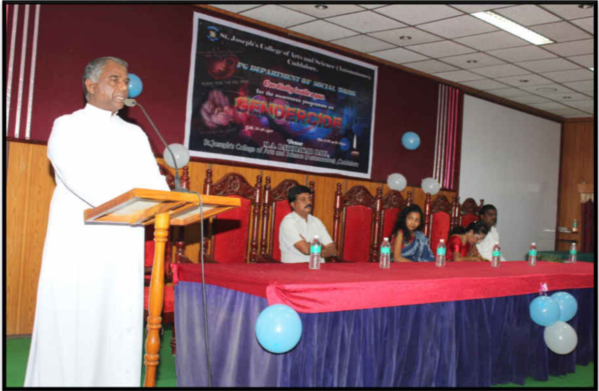
(Felicitation was given by Rev. Fr. Secretary)