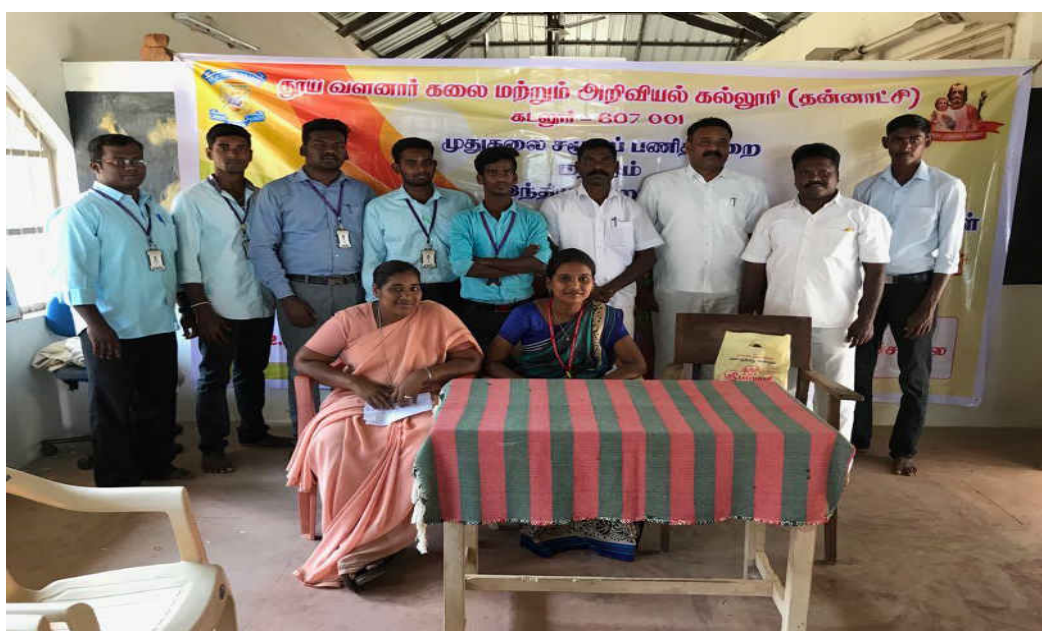
(The students during the competitions at Central Prison)