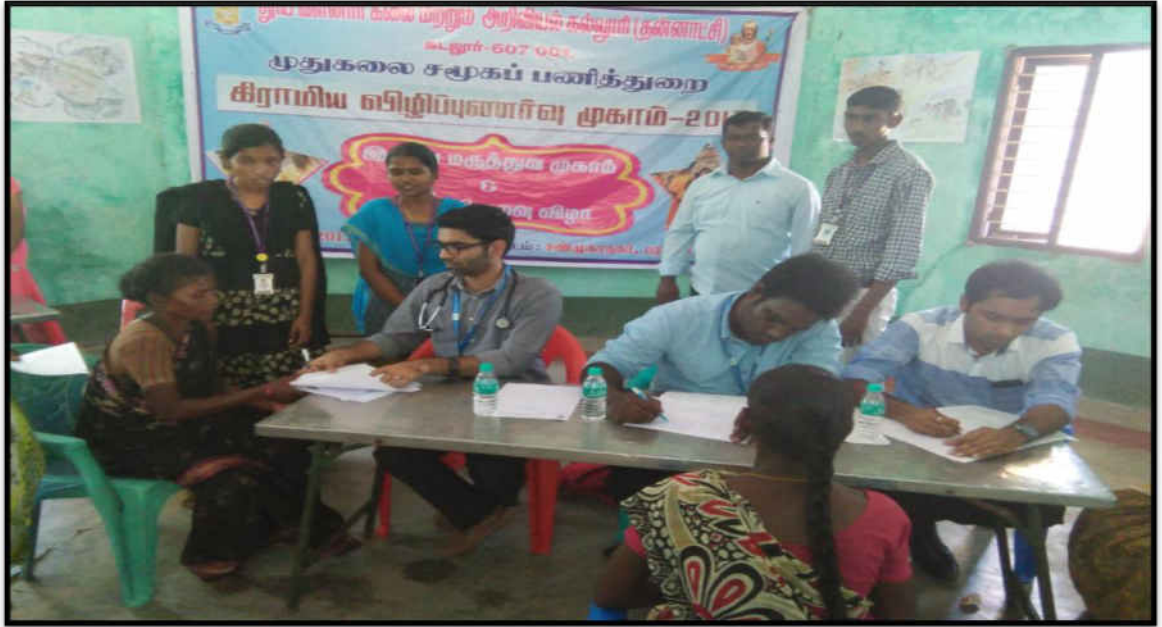
Doctor diagnosing the patients