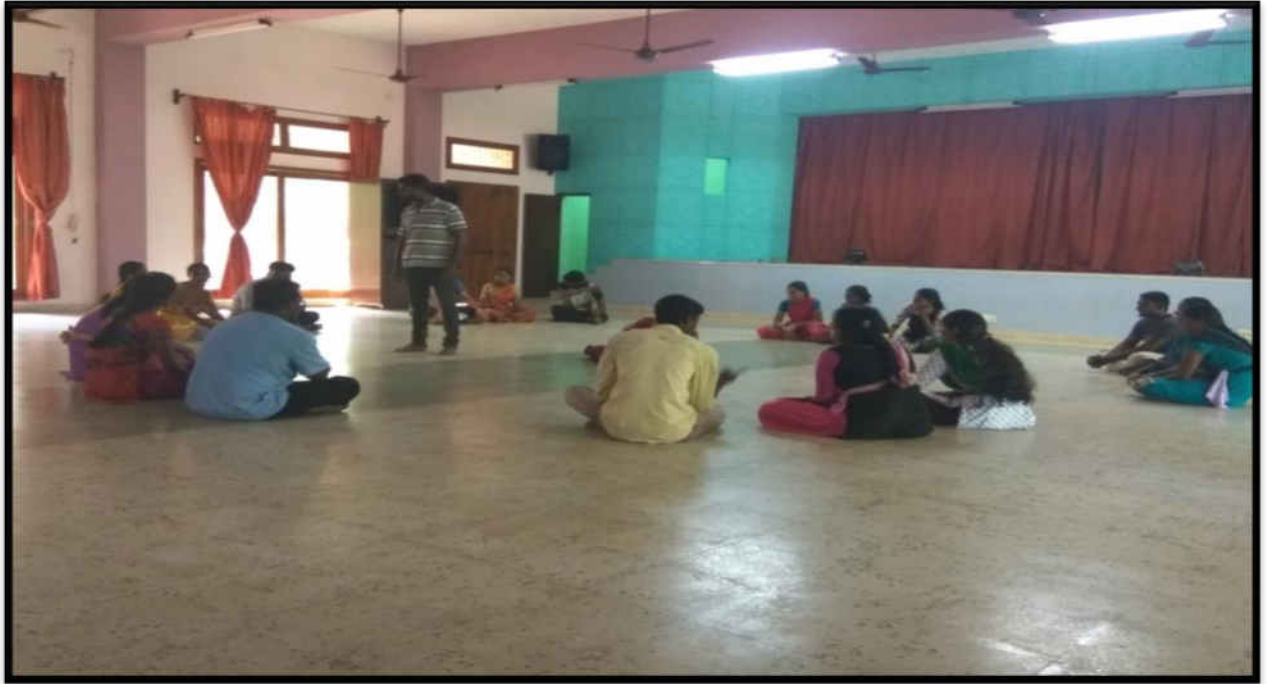
(The resource person teaching street play for the students)