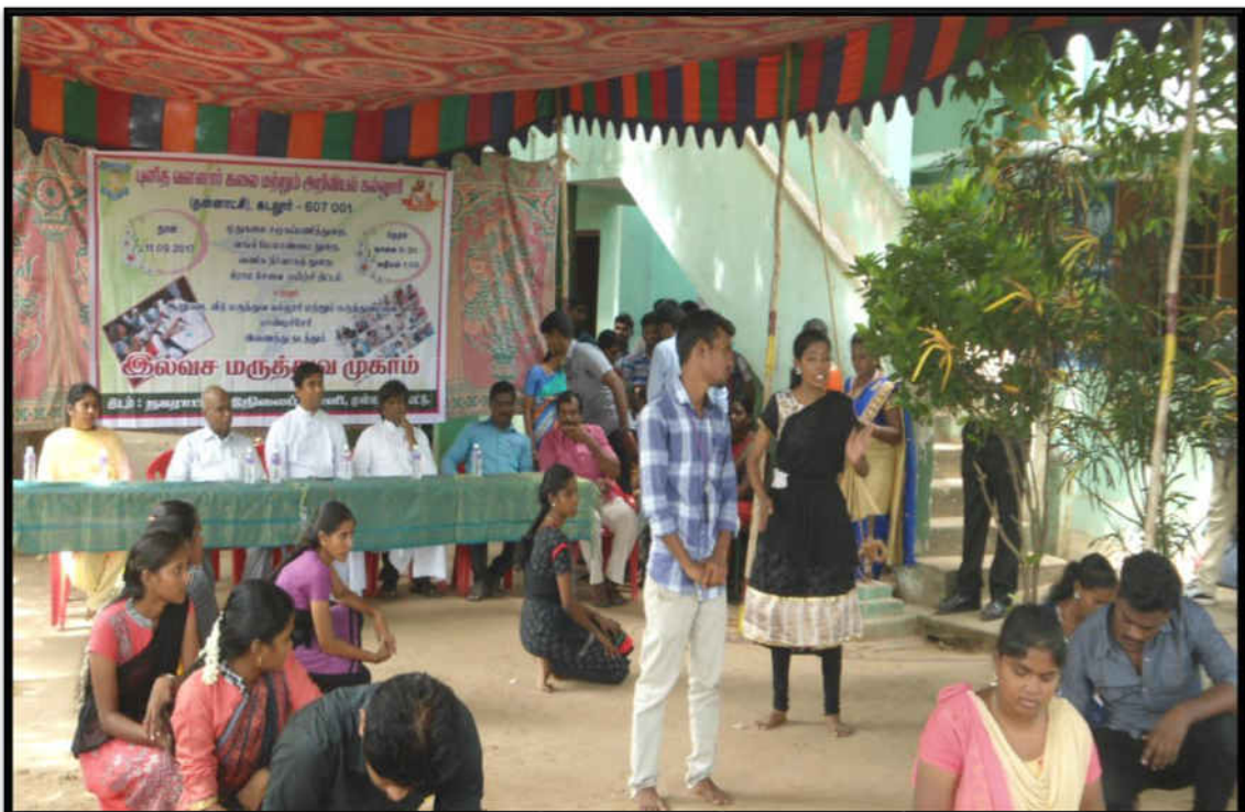
(Street play on Dengue by MSW students)