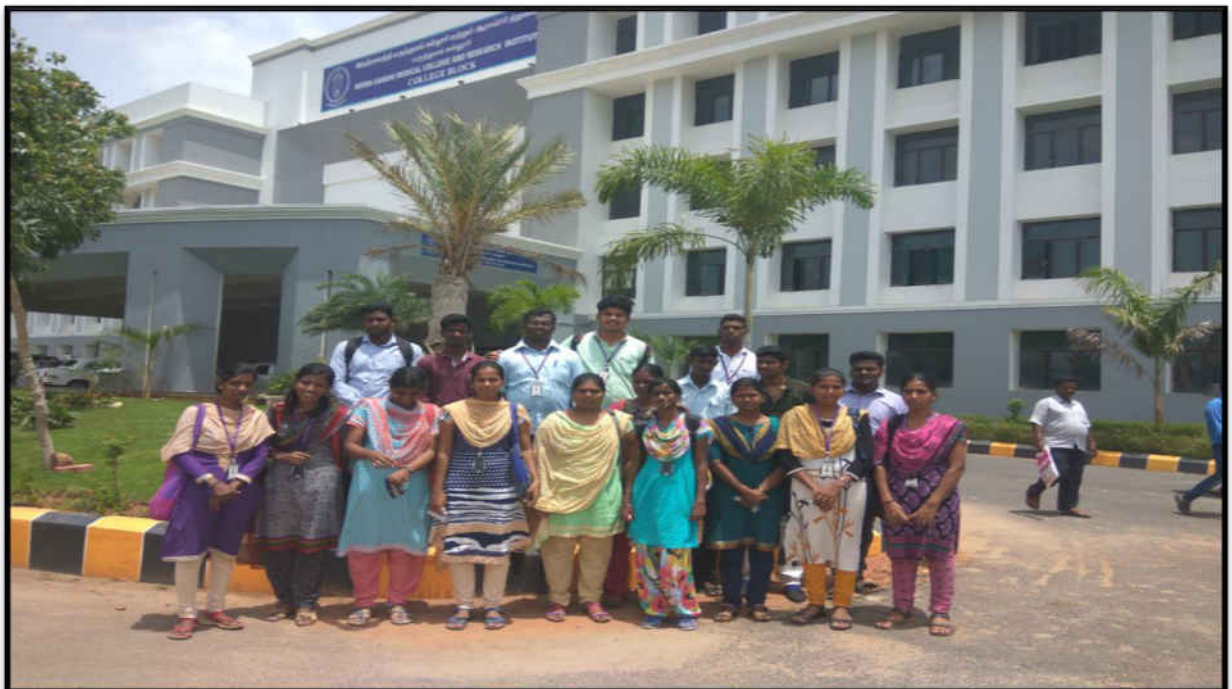
(I MSW students during their visit to Indra Gandhi Medical College & Research Institute)