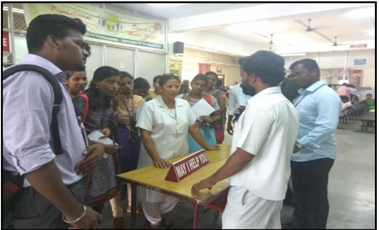
(The trainees interacted with staff)

On 18.08.2017, I year MSW students along with two faculty members went to Indira Gandhi Medical College & Research Institute, Pondicherry for their observation visit in order to keenly watch the activities being carried out in this place and to have exposure on social work practices. The trainees learned the organization structure, various Departments and the role of social worker in hospital settings. The students of MSW gathered the lot of information and got experience in the hospital setting.