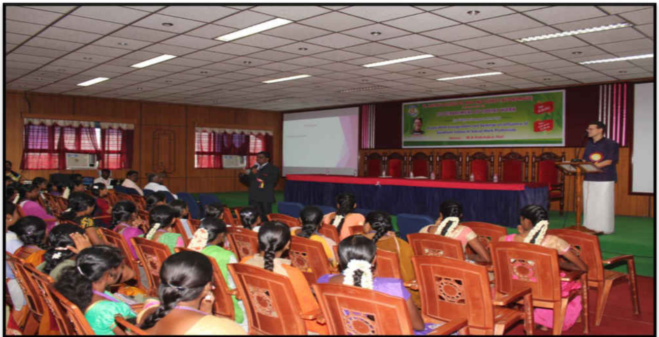
(Interaction with students)