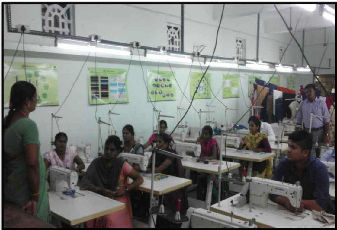
(The trainee's discussion with the agency supervisor)

On 19.07.2017 I year MSW students along with two faculty members went to SAMSSS (South Arcot Multipurpose Social Service Society), Vikkravandi for their observation visit to have exposure on social work practices. The organization serves all the people in order to empower the marginalized communities to attain improved living standards and self sufficiency and their field of service for the developmental, social, cultural, health, awareness, animation, non-formal education for the people. The trainees gathered the lot of information from the organization.