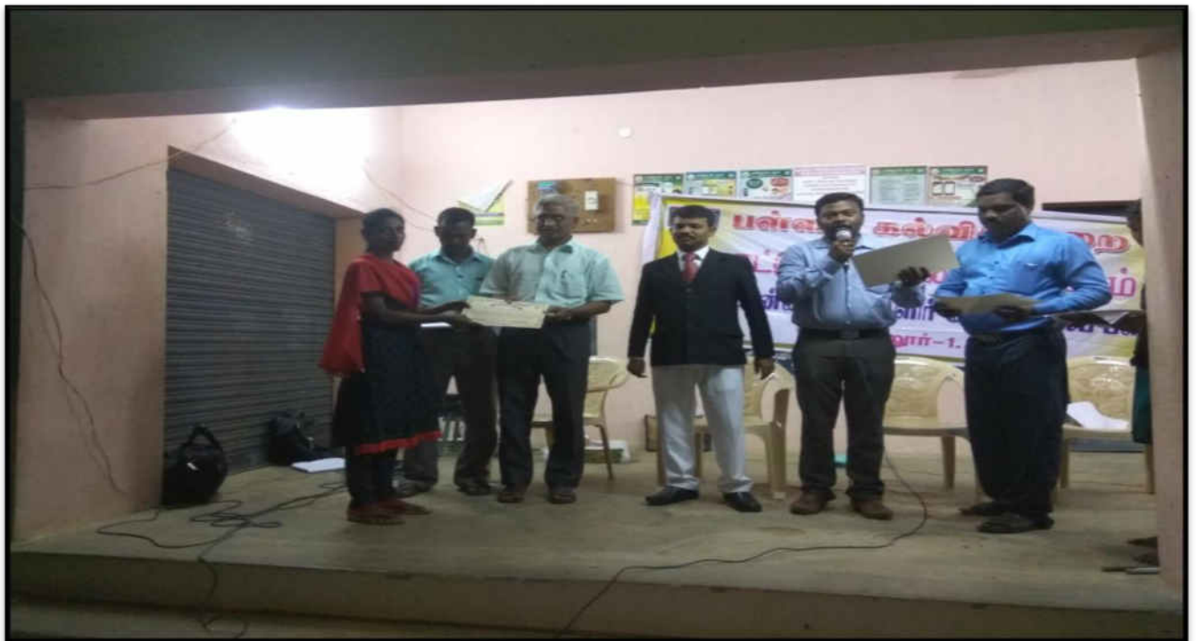
(Certificate distribution to MSW students)