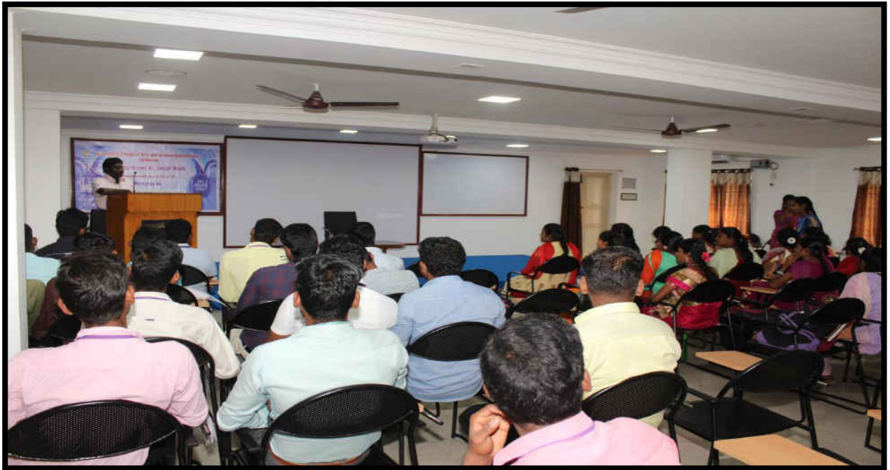
(Chief Guest addressing the students)