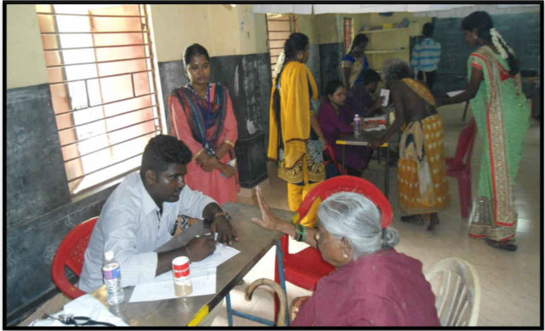
(Doctor diagnosing the patients)