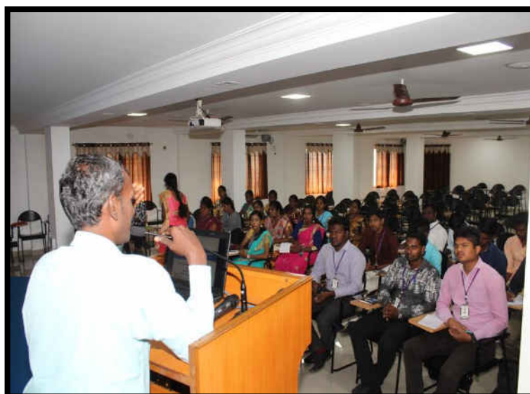
(Project Proposals reviewed by resource person)