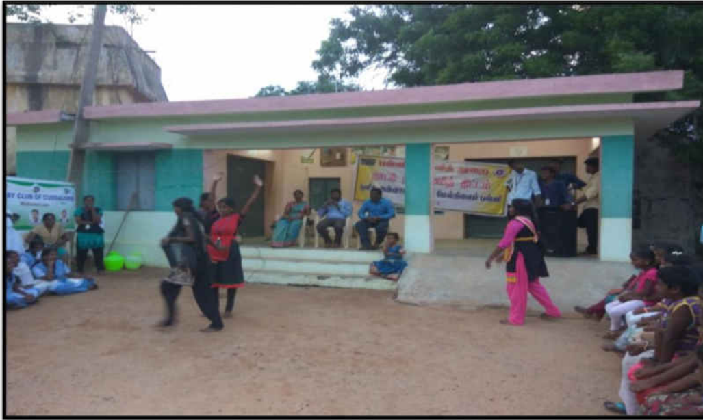
(Street play on importance of tree by MSW students)