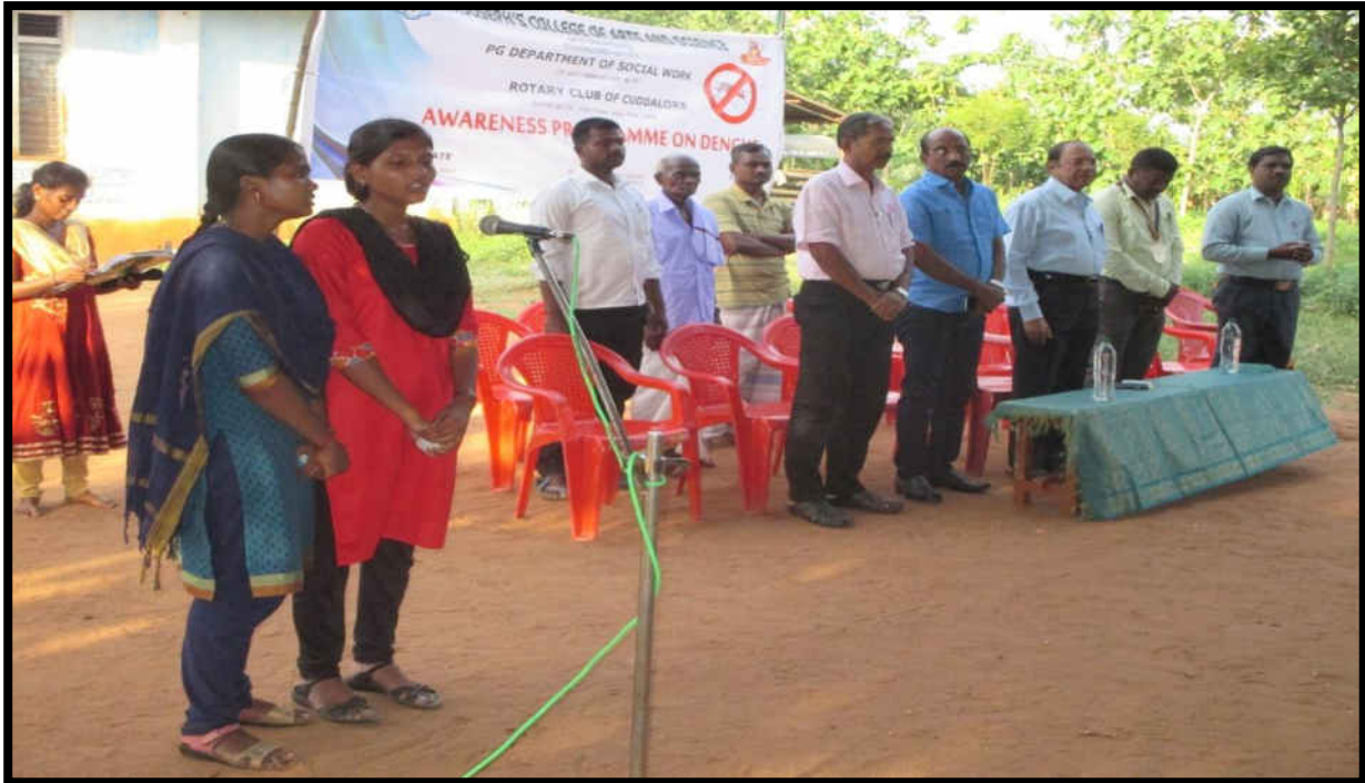
(Prayer song sung by MSW students)