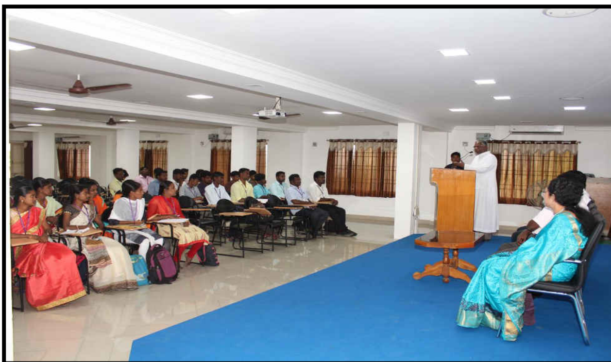
(Rev. Fr. Secretary gave presidential message)