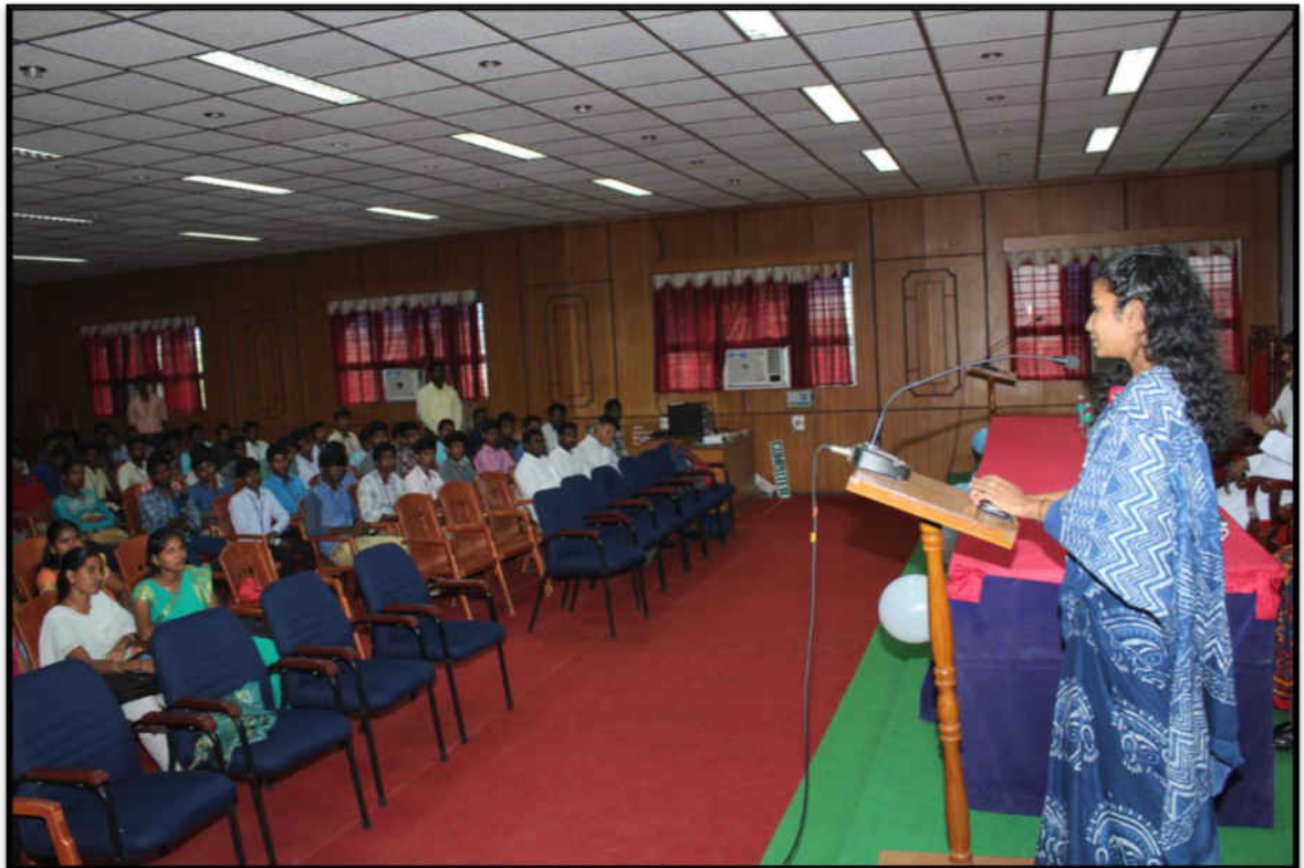
(Chief Guest inspiring speech to the participants)