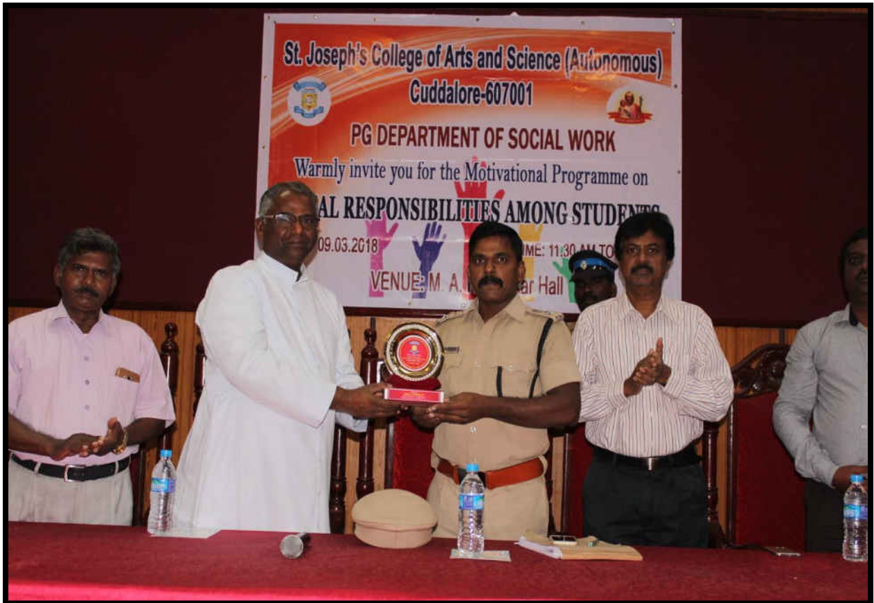
(Honouring the Chief Guest)