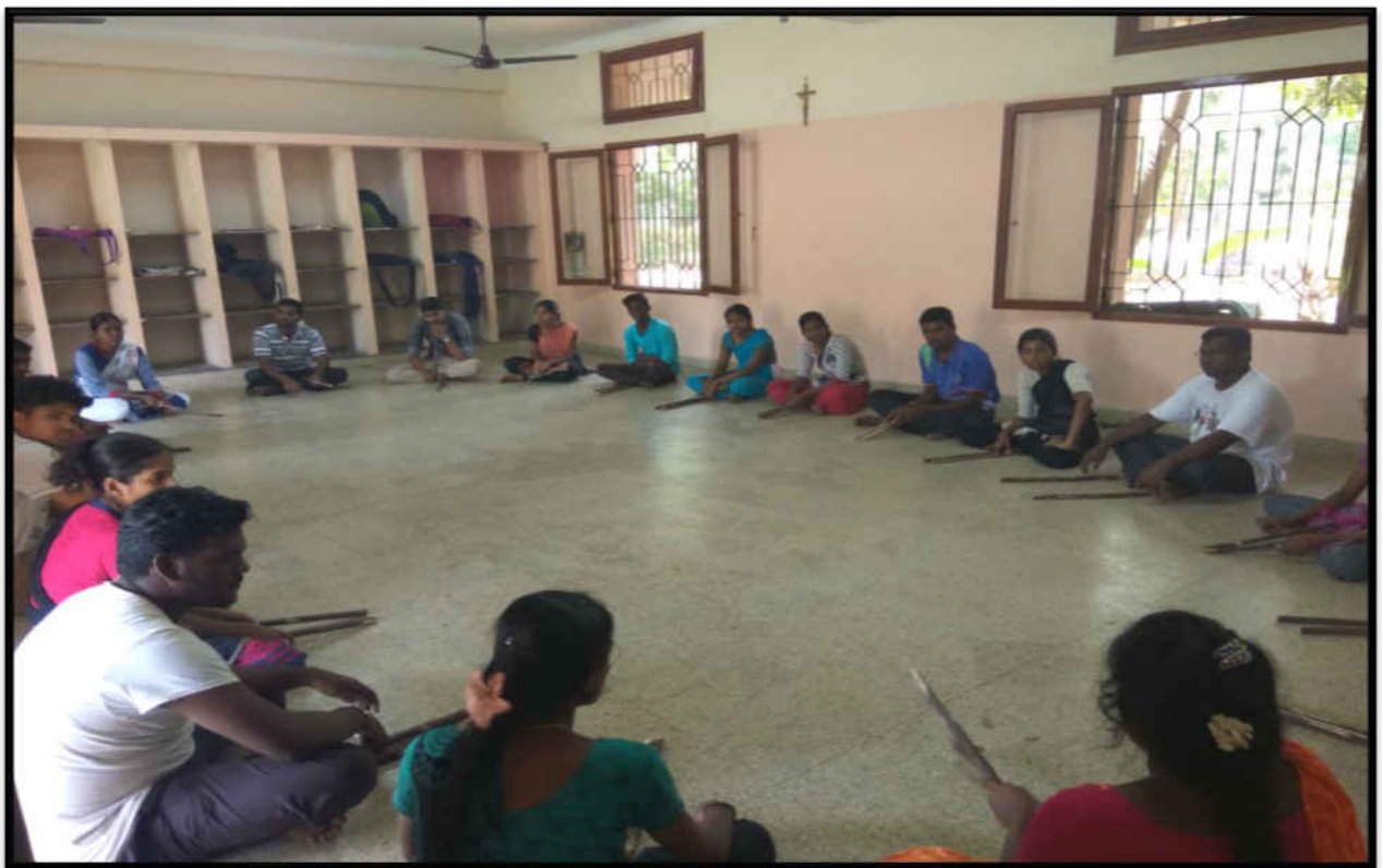
(The resource person teaching Kollattam for the students)