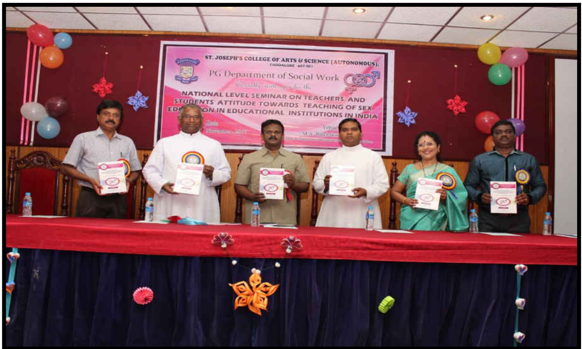
(Release of Abstract book by Secretary)