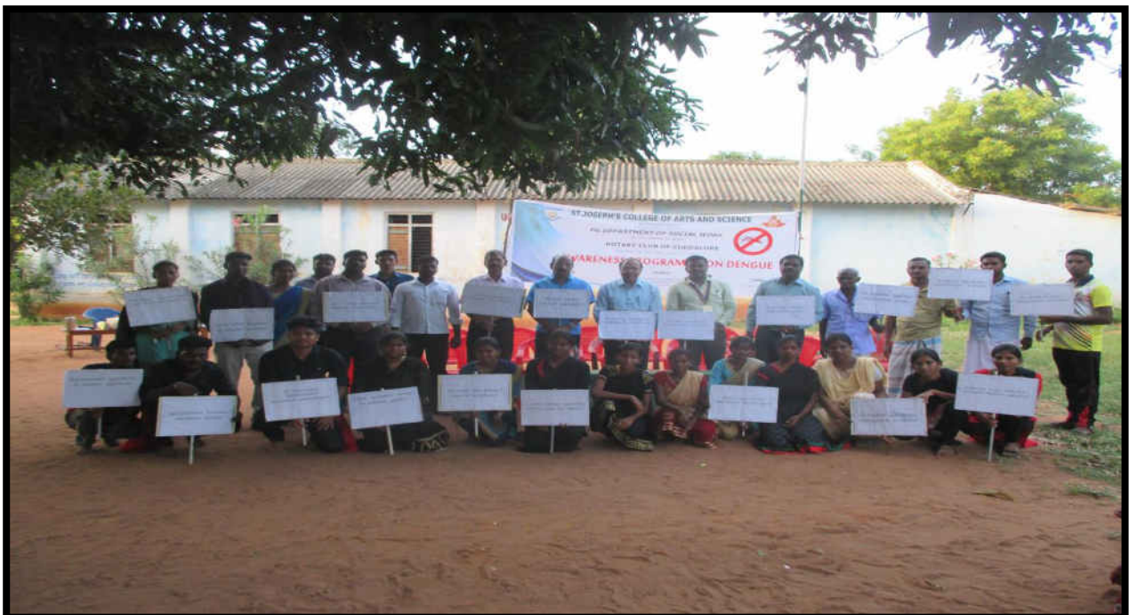
(Street play on dengue awareness by MSW students)