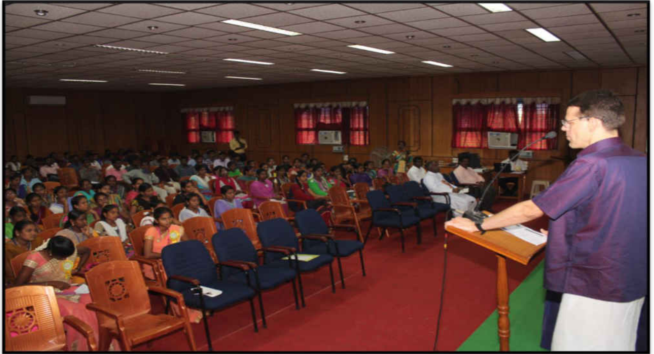
(Inspiring Speech by the Chief Guest)