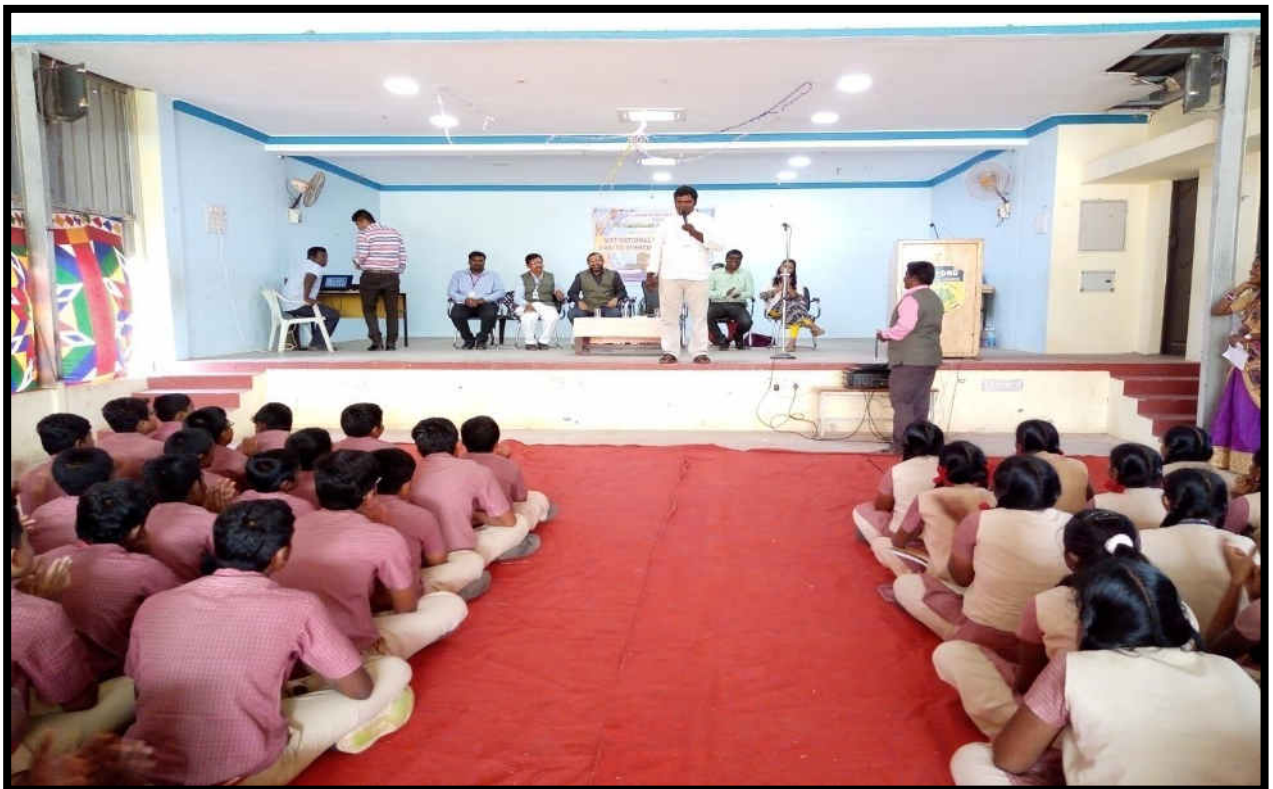
(Inspiring speech by Chief Guest)