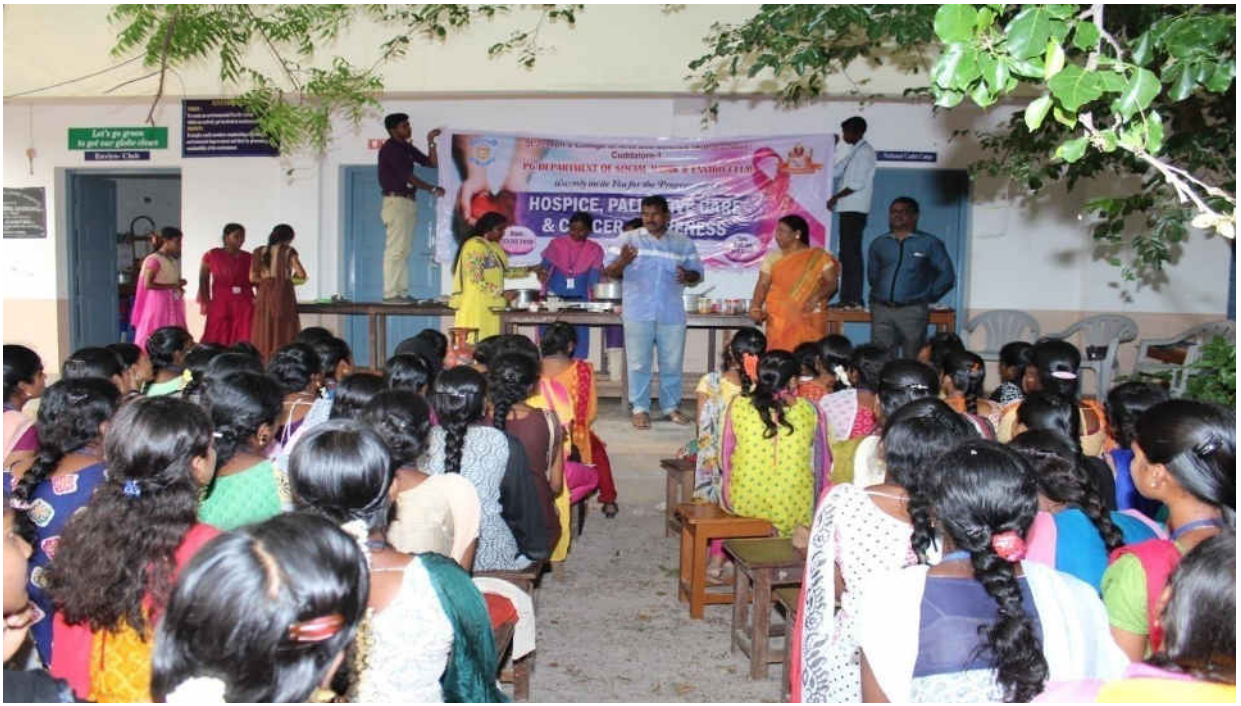
(Demonstration to the students on preparation of healthy food)