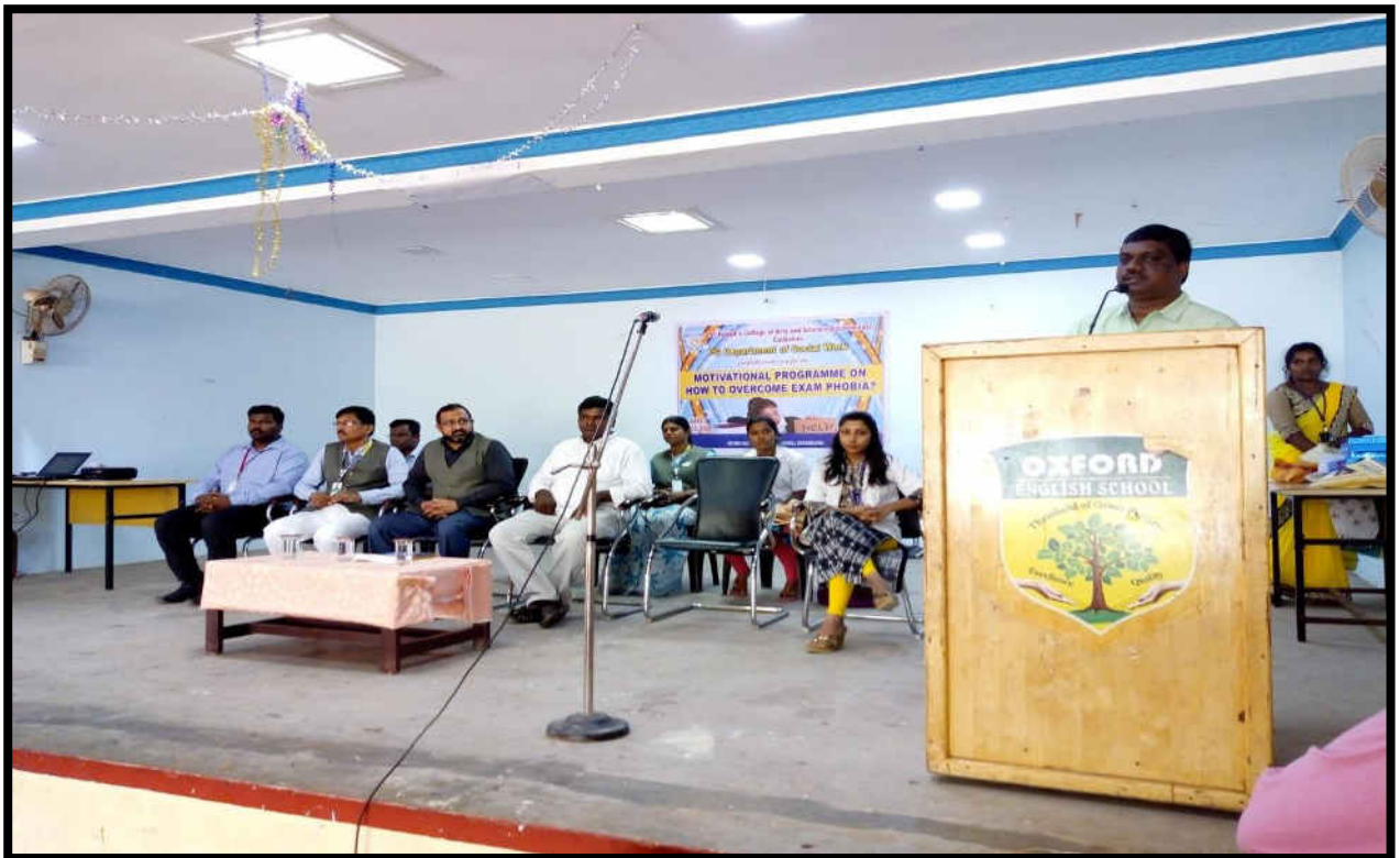
(Introducing the Chief Guest by Head of the Department)