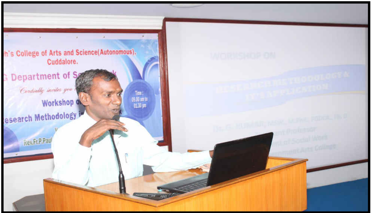
(Speech by Chief Guest)