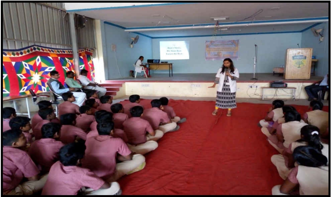
(Chief Guest interaction with students)