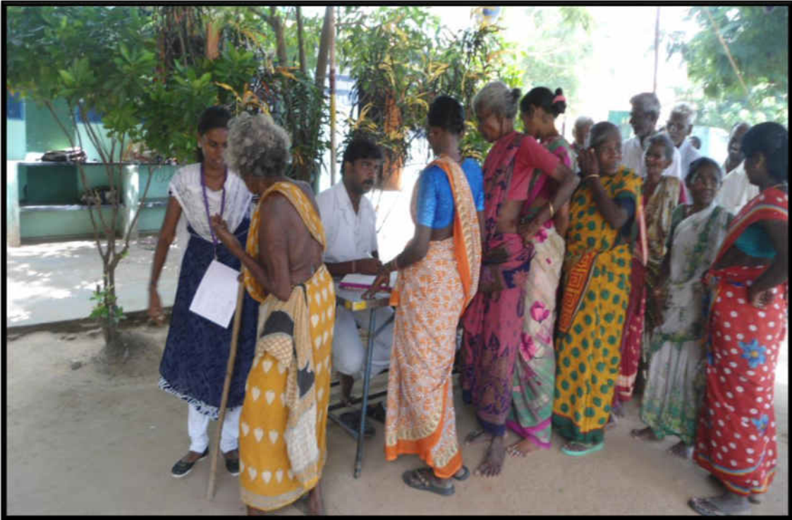
(Patient's registering their names and collecting their forms)