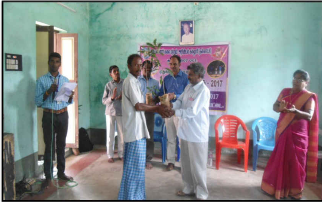
Distribution of saplings to the public.