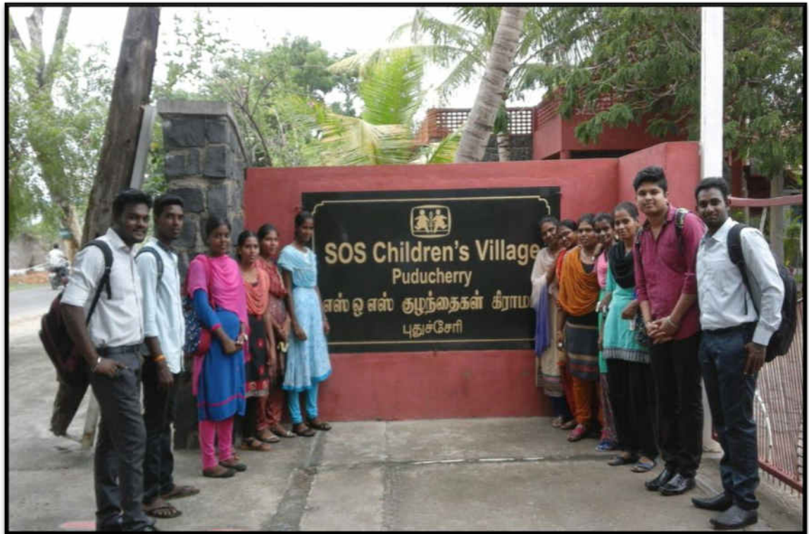
(The trainees in the SOS Children's Village)