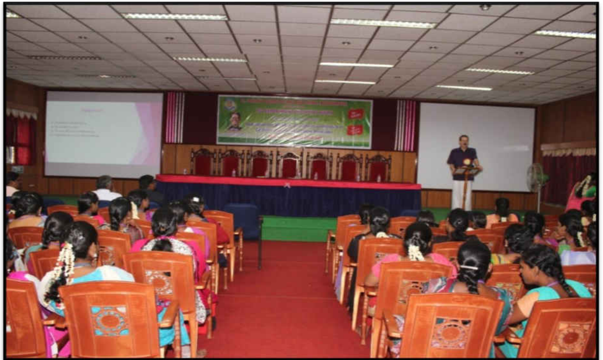
(The Chief Guest sharing his thoughts)