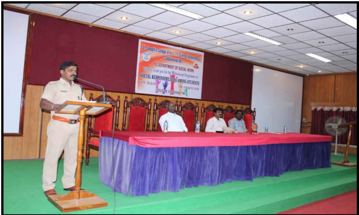
(Chief Guest motivating the students by his speech)