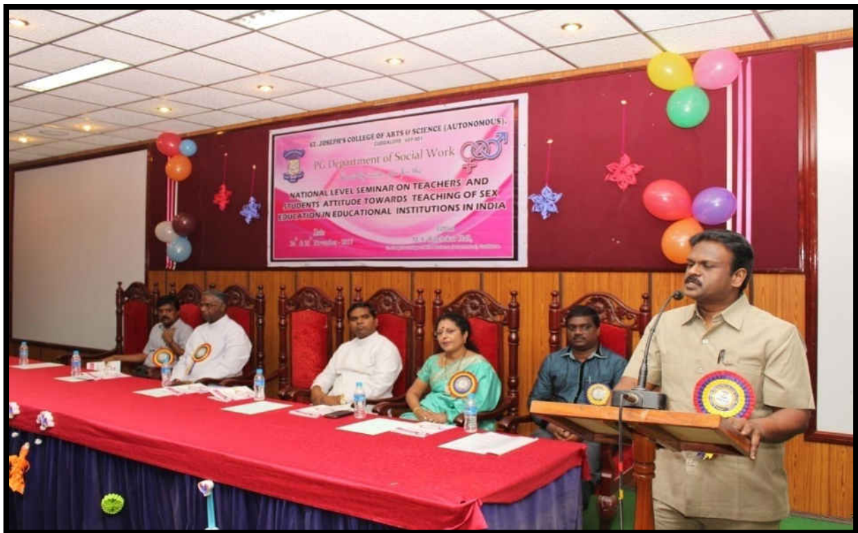
(Inspiring speech by the Chief Guest)