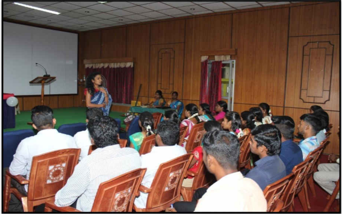
(Resource person inspiring speech to the participants)