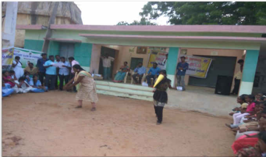
Street play on Dengue Awareness)