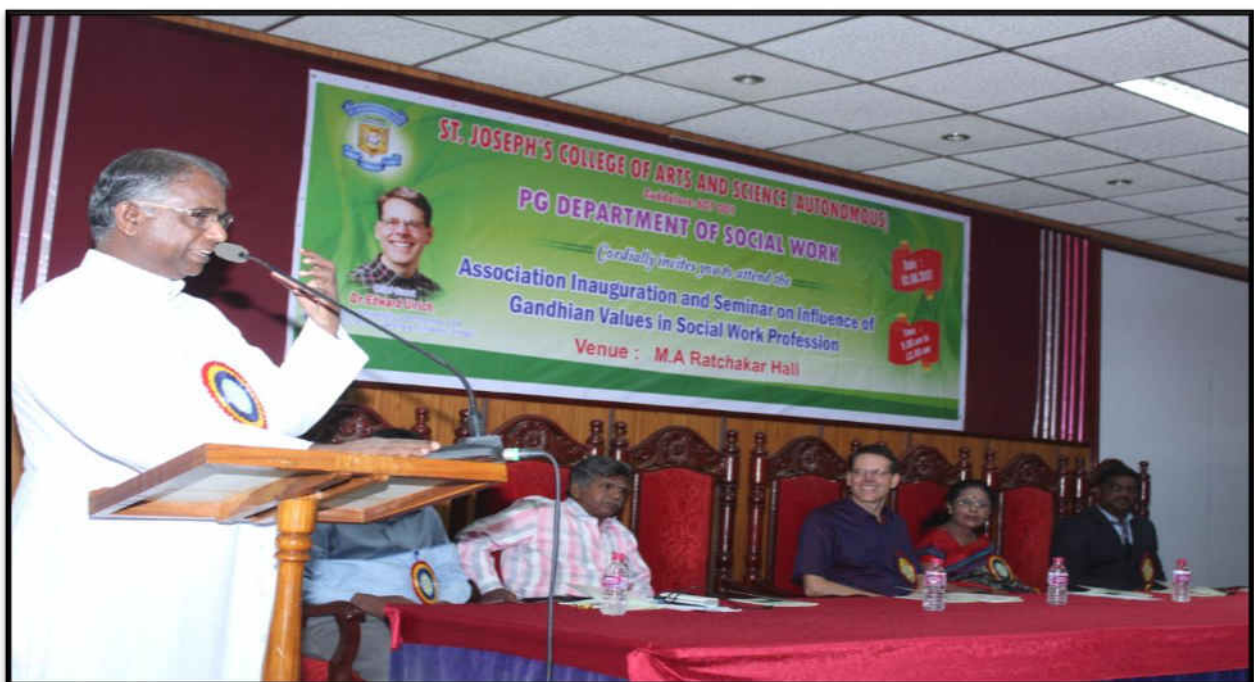
(Presidential address by Rev. Fr. Secretary)