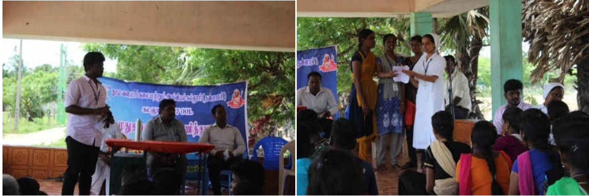
(Students at camp)