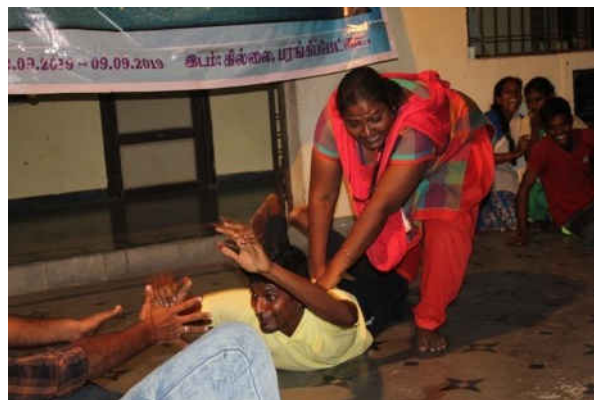
(Students at camp)