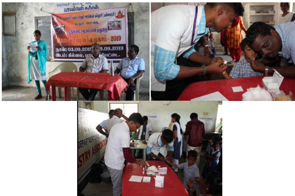
(At Blood Donation camp)

Tribal awareness camp for the year 2019 was held from 03.09.2019 to 09.09.2019 at three various places like Killai, Thiruvalluvar Nagar and Kalaignar Nagar Parangipettai block Cuddalore district. On 09.09.2019 at 10.00 am Blood Group Camping programme was organised by the Social work Department and Bio Chemistry Department collaboratively.