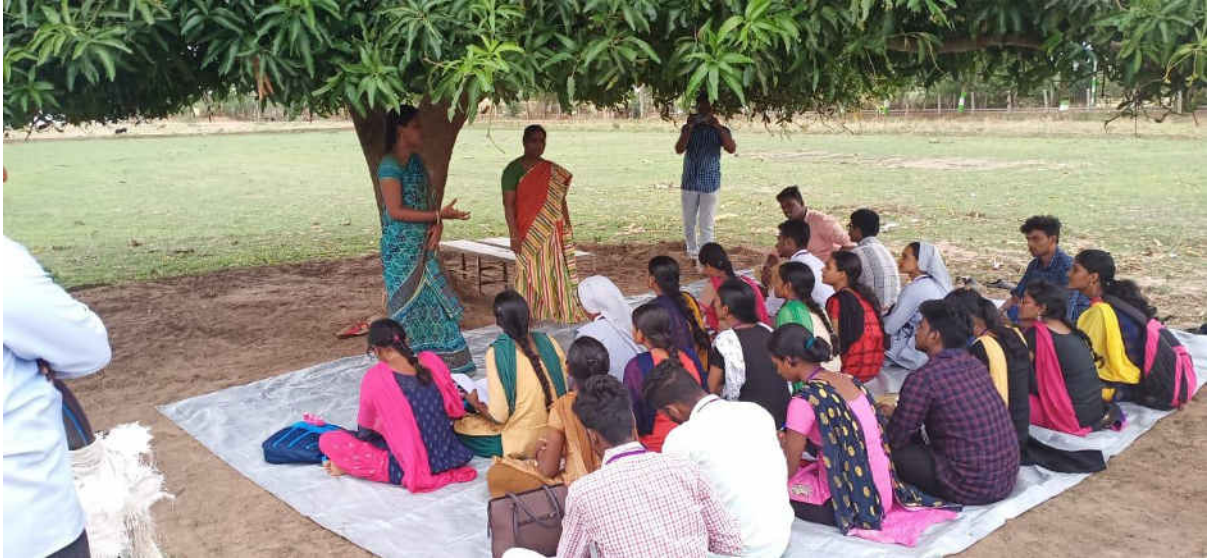
(Students at Observation visit)