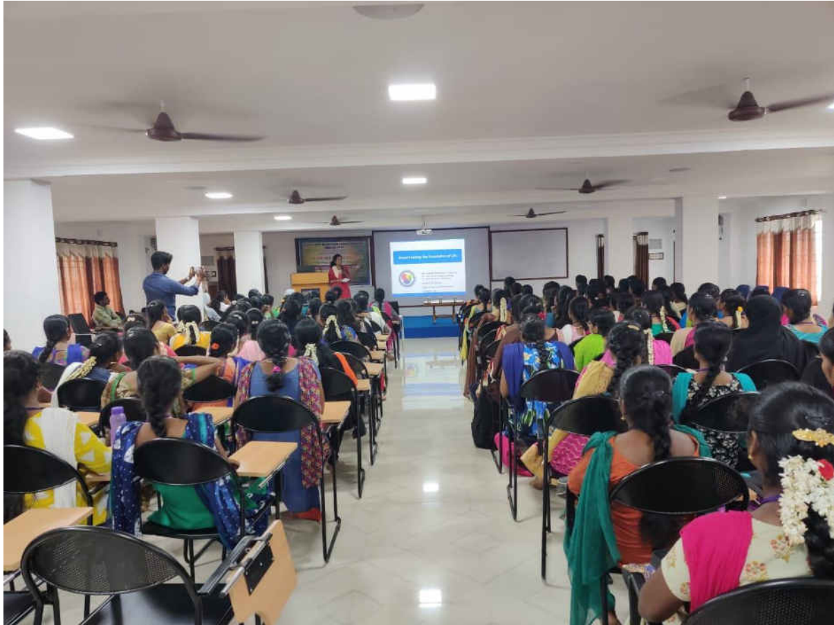
(An Awareness Programme on Breast Feeding-Foundation of Life)