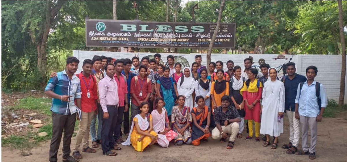
(Students at observation visit)

given by I year MSW student and she thanked the NGO and its members for the initiative taken to give inputs and enlighten in spite of busy schedule. After that NGO administration visit was done.