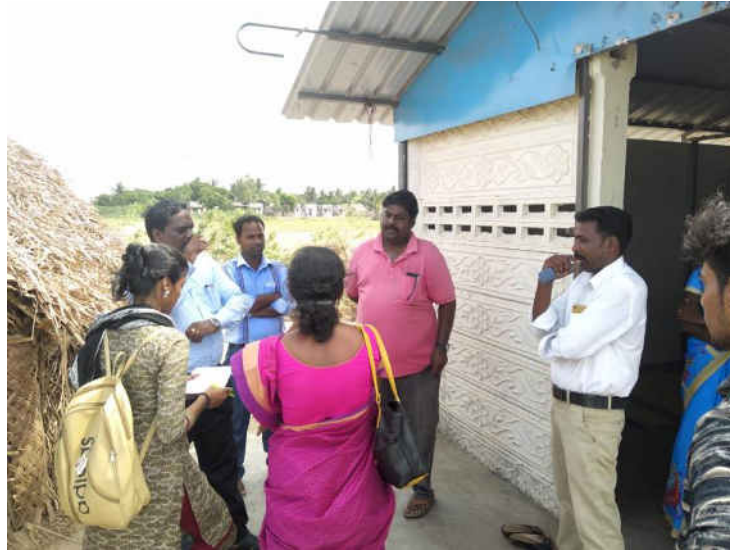
(Pilot Visit 1 photo)

students of I year MSW. Florence Foundation Home rendered help to visit the different places which requires a societal change. Staff members and students visited the place for stay and finalized the places of conducting rural awareness camp finally the visit got over by 4.00 pm.