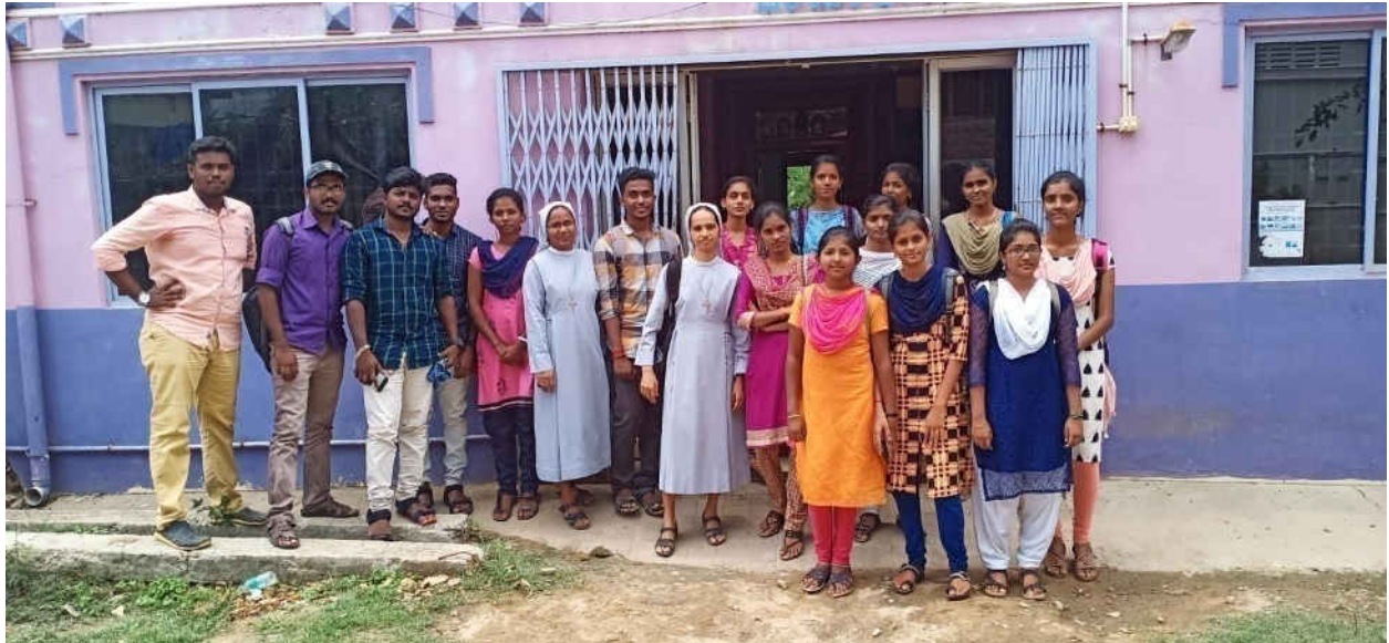
(Students at observation visit)