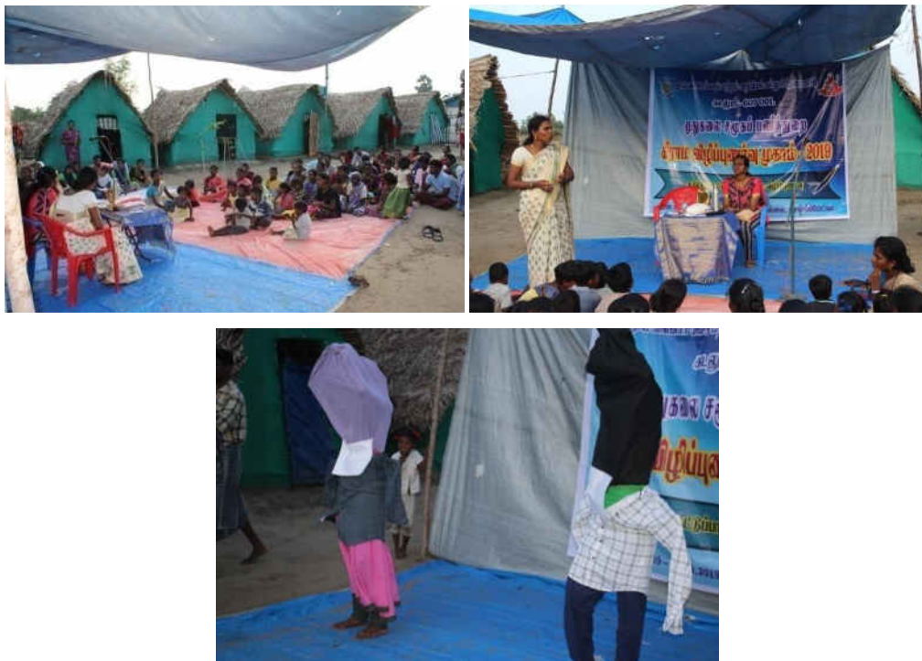
(Students at Awareness Programme)