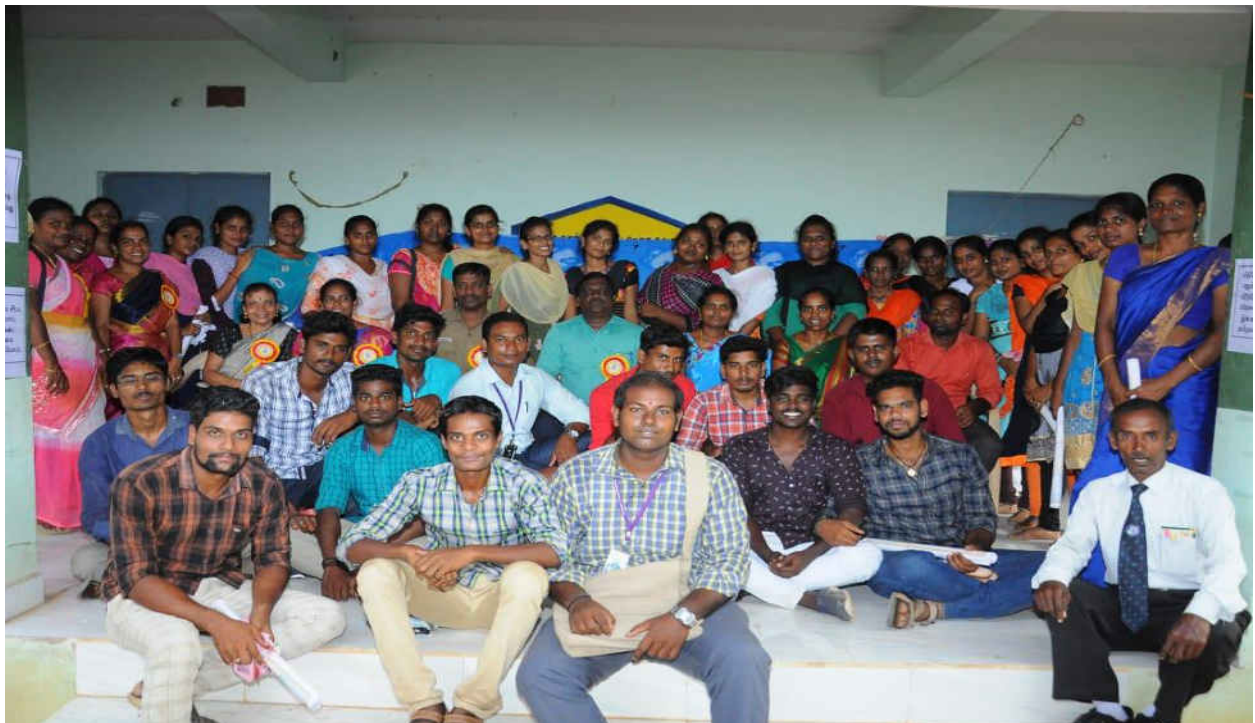
(Students at Awareness Programme)