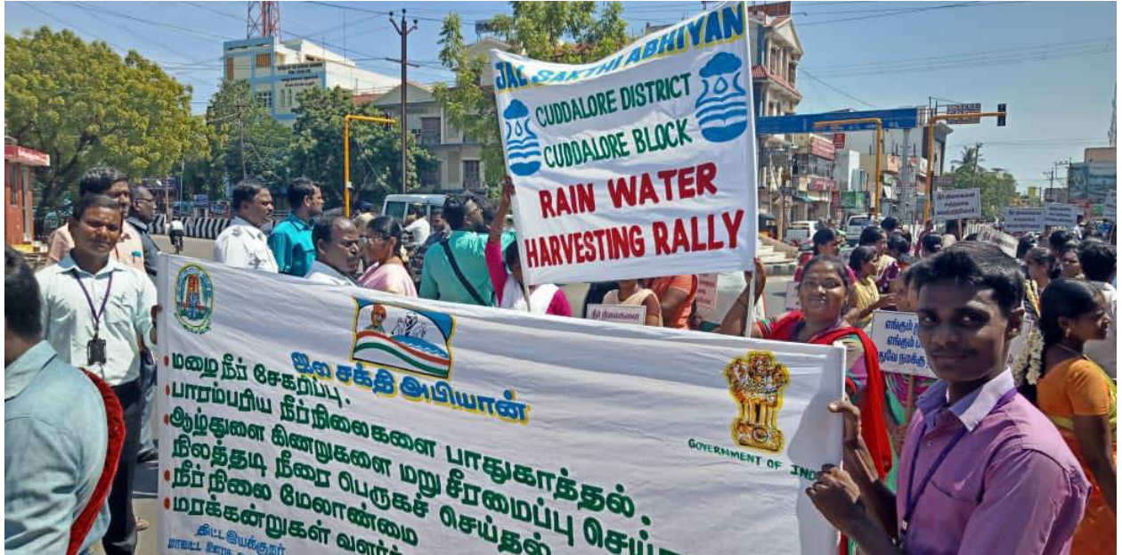
Student Participation in Rally