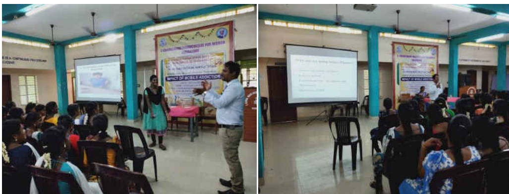
(Chief Guest address the gathering)