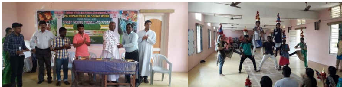
(Performance by MSW students)