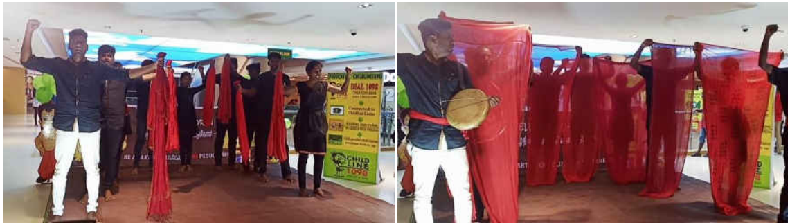
(Awareness Programme by Students)

Child Line 1098 has become an integral part of the integrated Child Protection scheme (ICPS) SINC 2009 which aims to ensure the rights and protection of the children. Child line Pudhucherry organized a mass awareness program on 17 th of November 2019 at Providence Mall Pondicherry as November 14 th to 20 th is observed as the children Se Dosti week across the country, child line has been conducting various awareness programs as part of this week and also increasing deeds for child line helpline services.