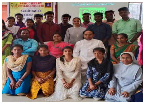
(Students at observation Visit)