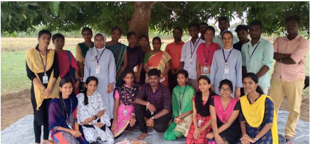
(Group photo of students)