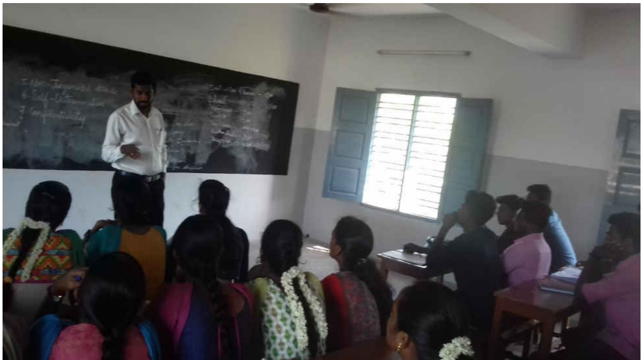
Resource Person Explaining about the Recent Cases